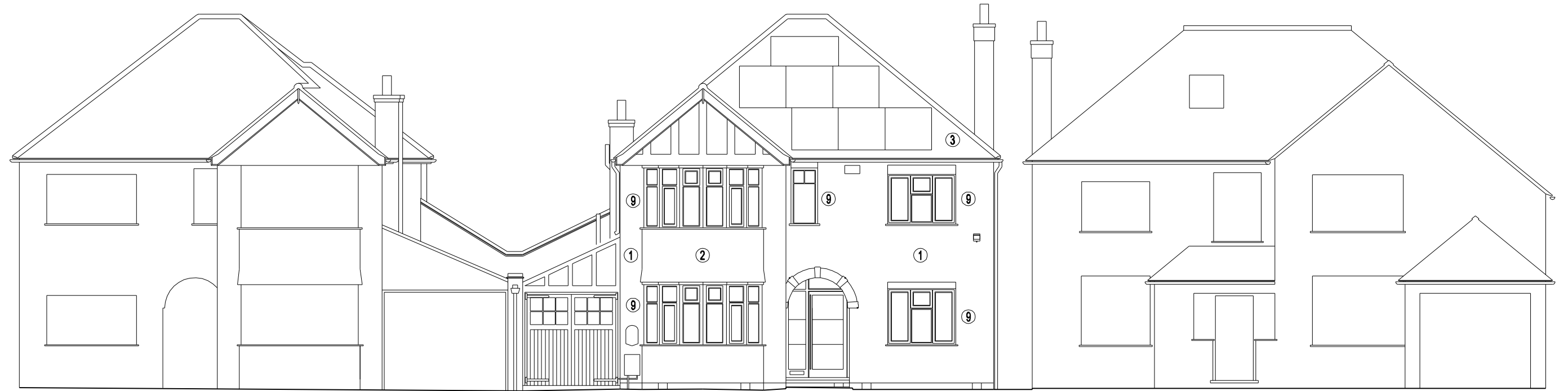
FRONT ELEVATION South