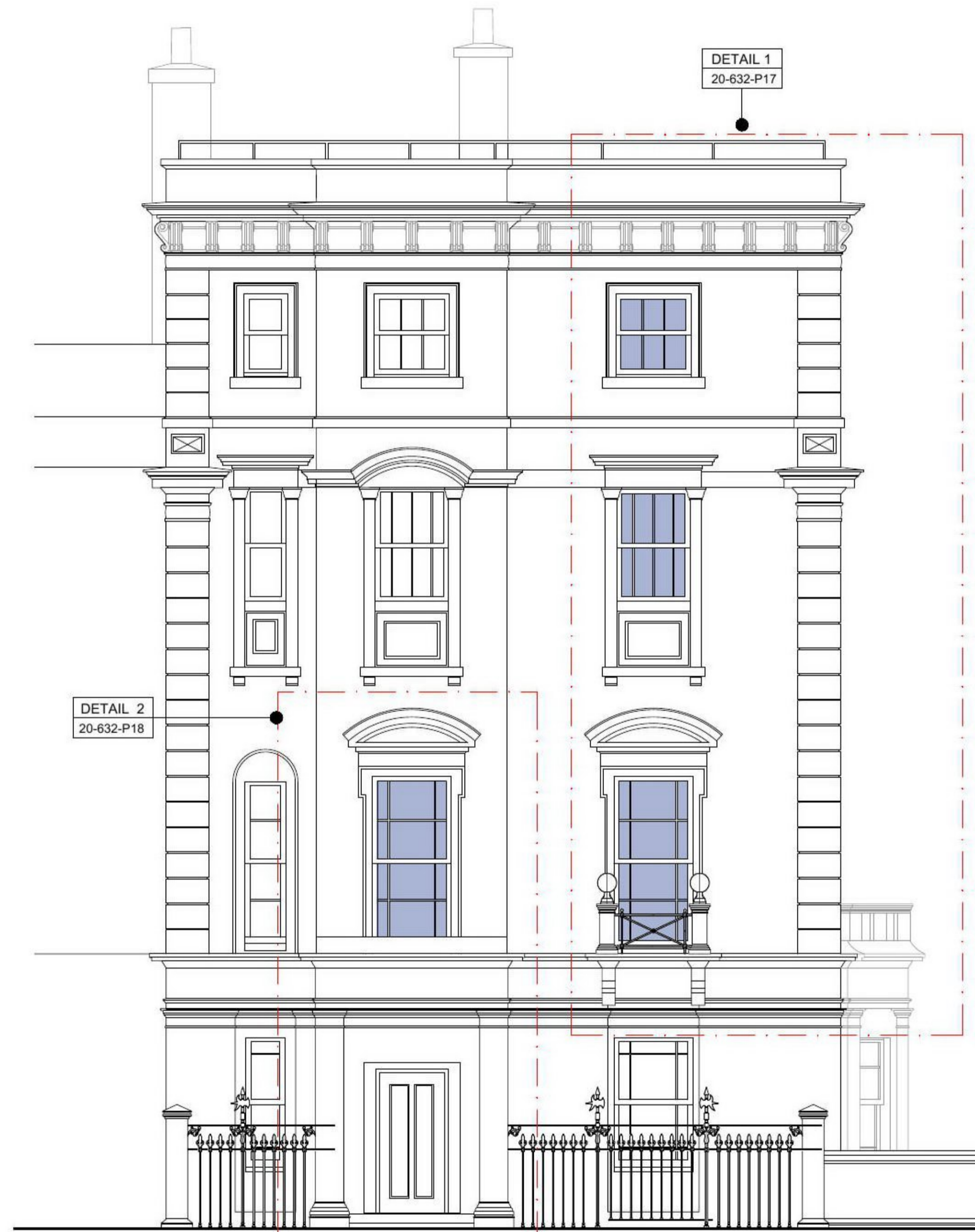
PROPOSED FRONT ELEVATION (SOUTH ELEVATION) SCALE 1:50 @A1 ALL NEIGHBORING PROPERTIES & LANDSCAPE IS INDICATIVE ONLY

All materials match the adjacent buildings on the terrace, with matching joinery, plasterwork, decorative elements and ironwork.