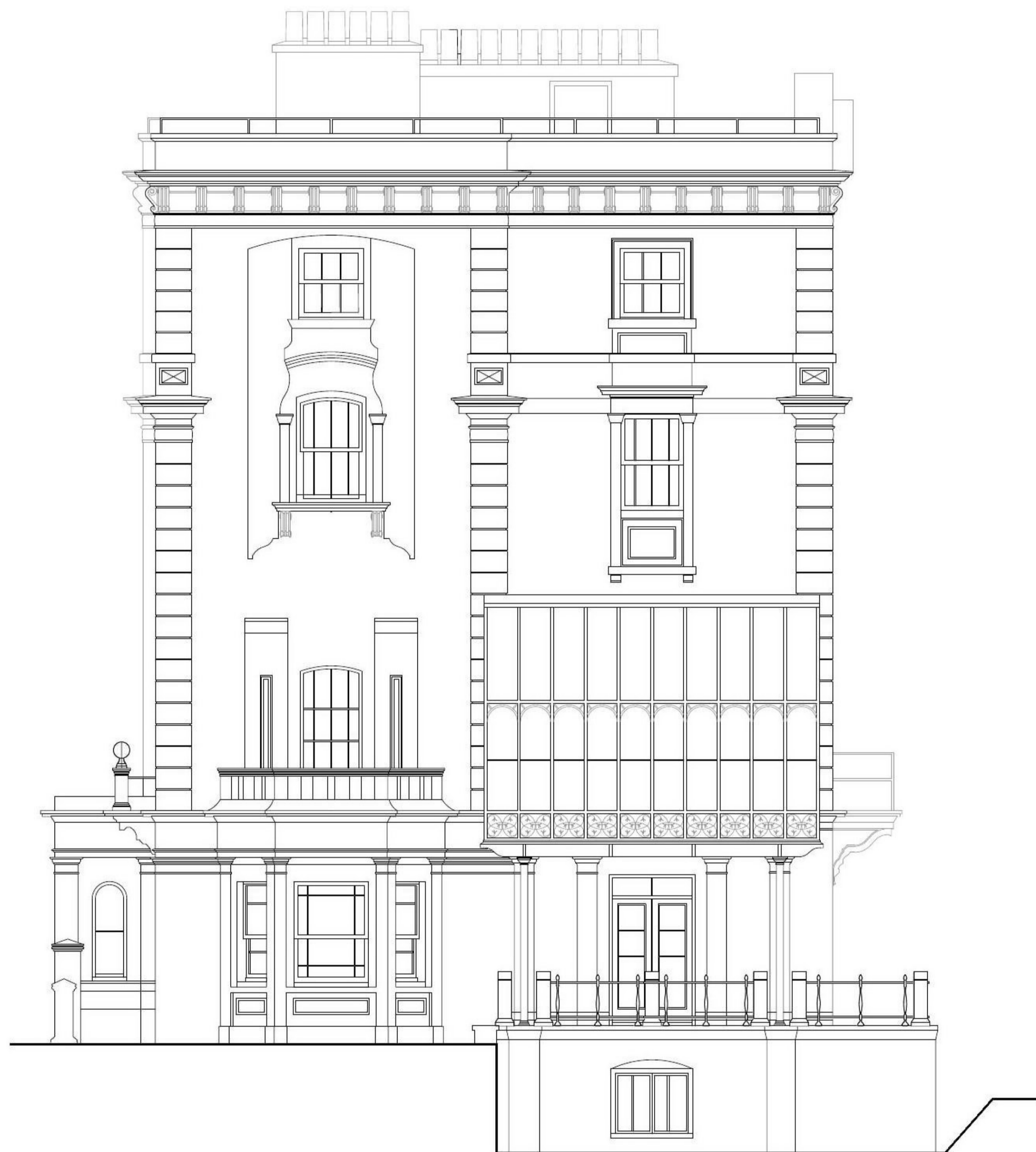
HISTORICAL SIDE ELEVATION (EAST ELEVATION) ALL NEIGHBORING PROPERTIES & LANDSCAPE IS INDICATIVE ONLY