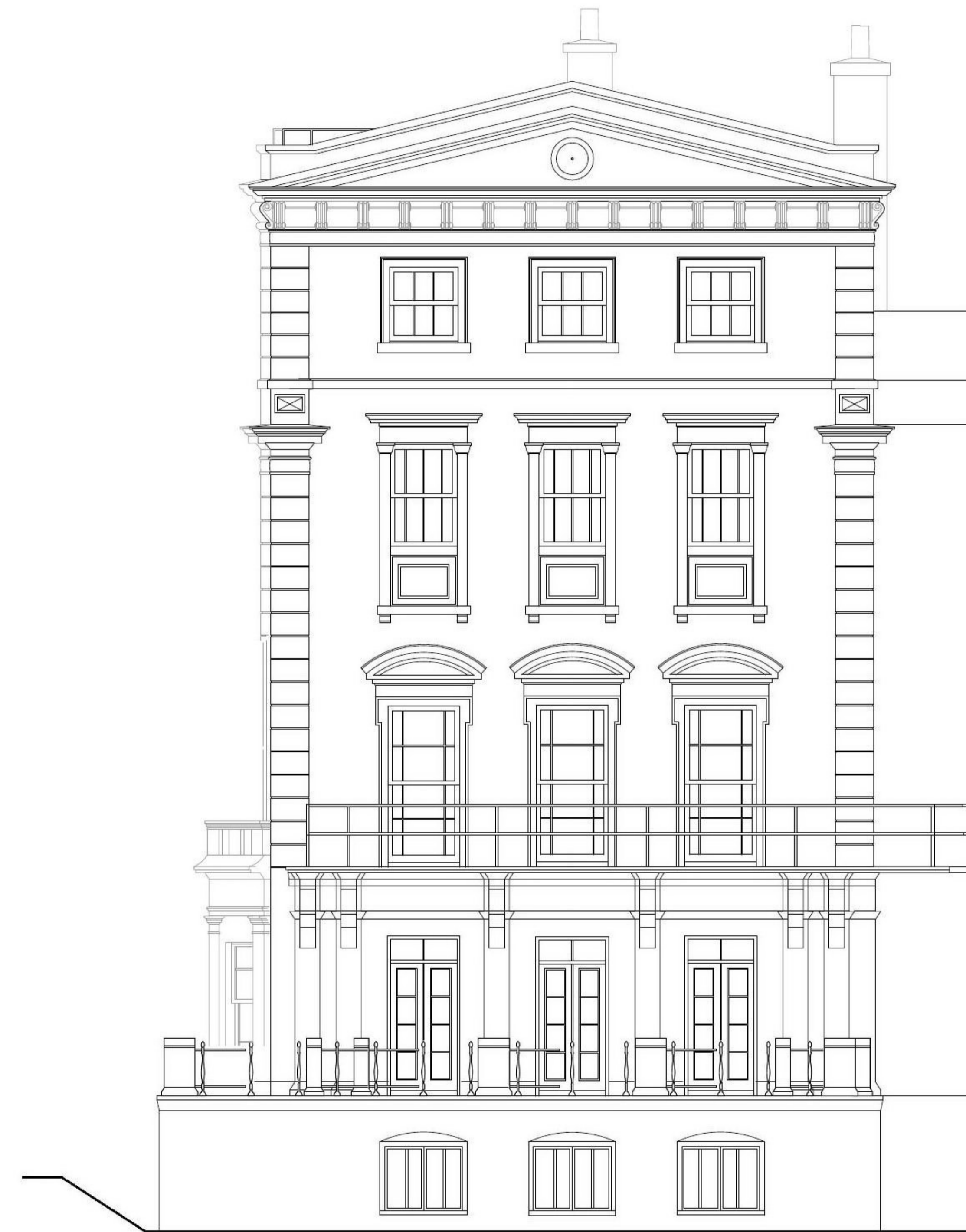
PROPOSED REAR ELEVATION (NORTH ELEVATION) ALL NEIGHBORING PROPERTIES & LANDSCAPE IS INDICATIVE ONLY