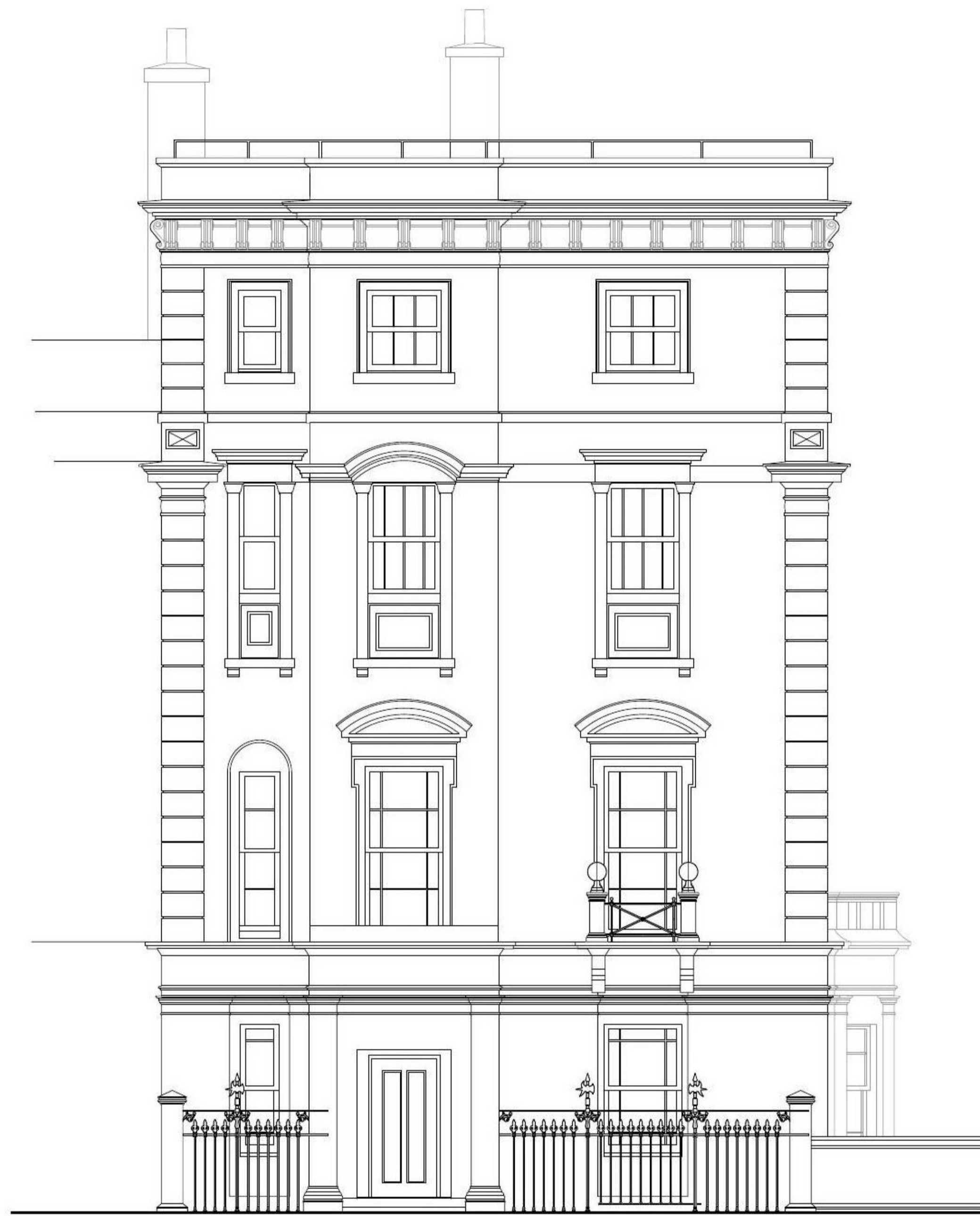
PROPOSED FRONT ELEVATION (SOUTH ELEVATION) ALL NEIGHBORING PROPERTIES & LANDSCAPE IS INDICATIVE ONLY