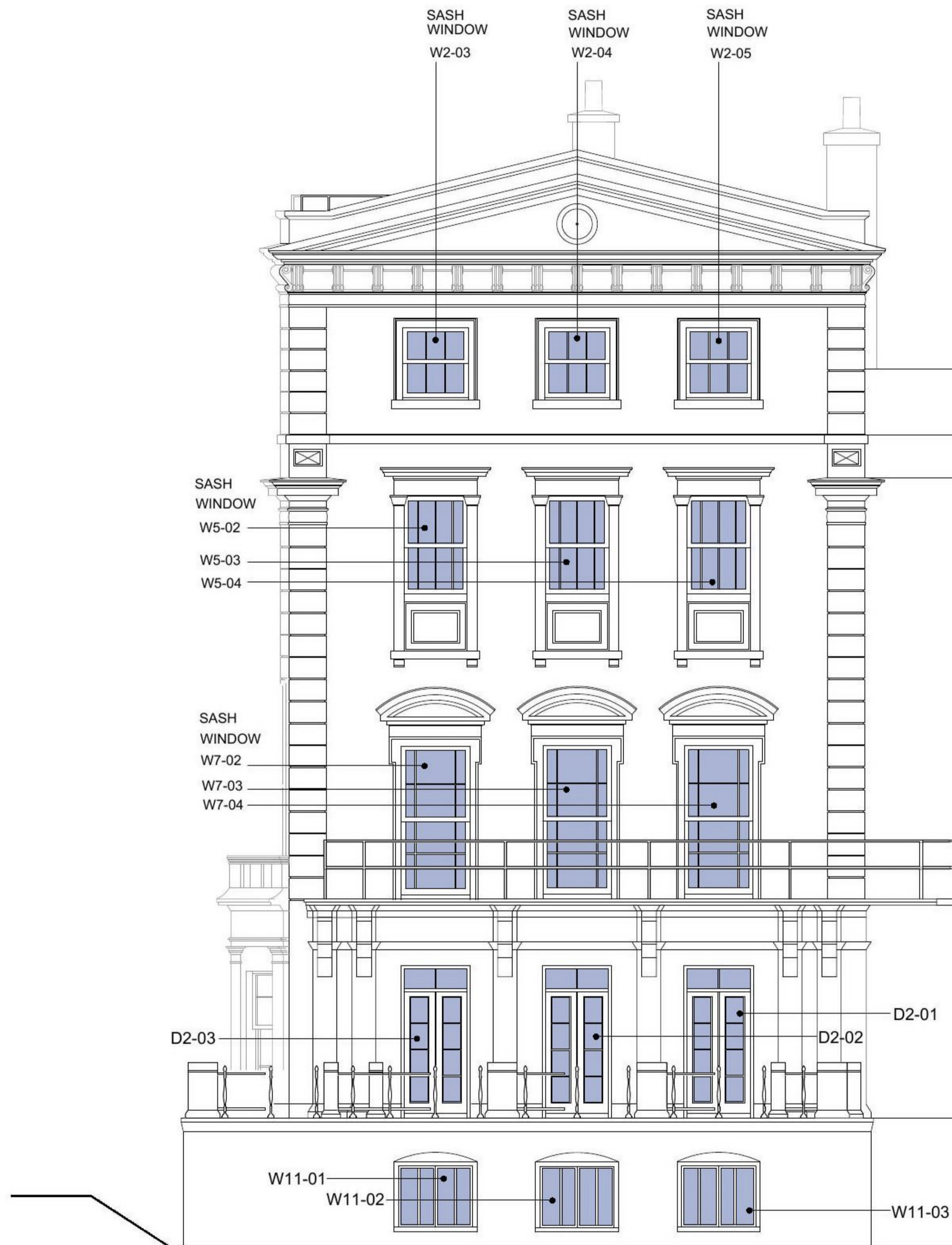
PROPOSED REAR ELEVATION (NORTH ELEVATION)

ALL NEIGHBORING PROPERTIES & LANDSCAPE IS INDICATIVE ONLY