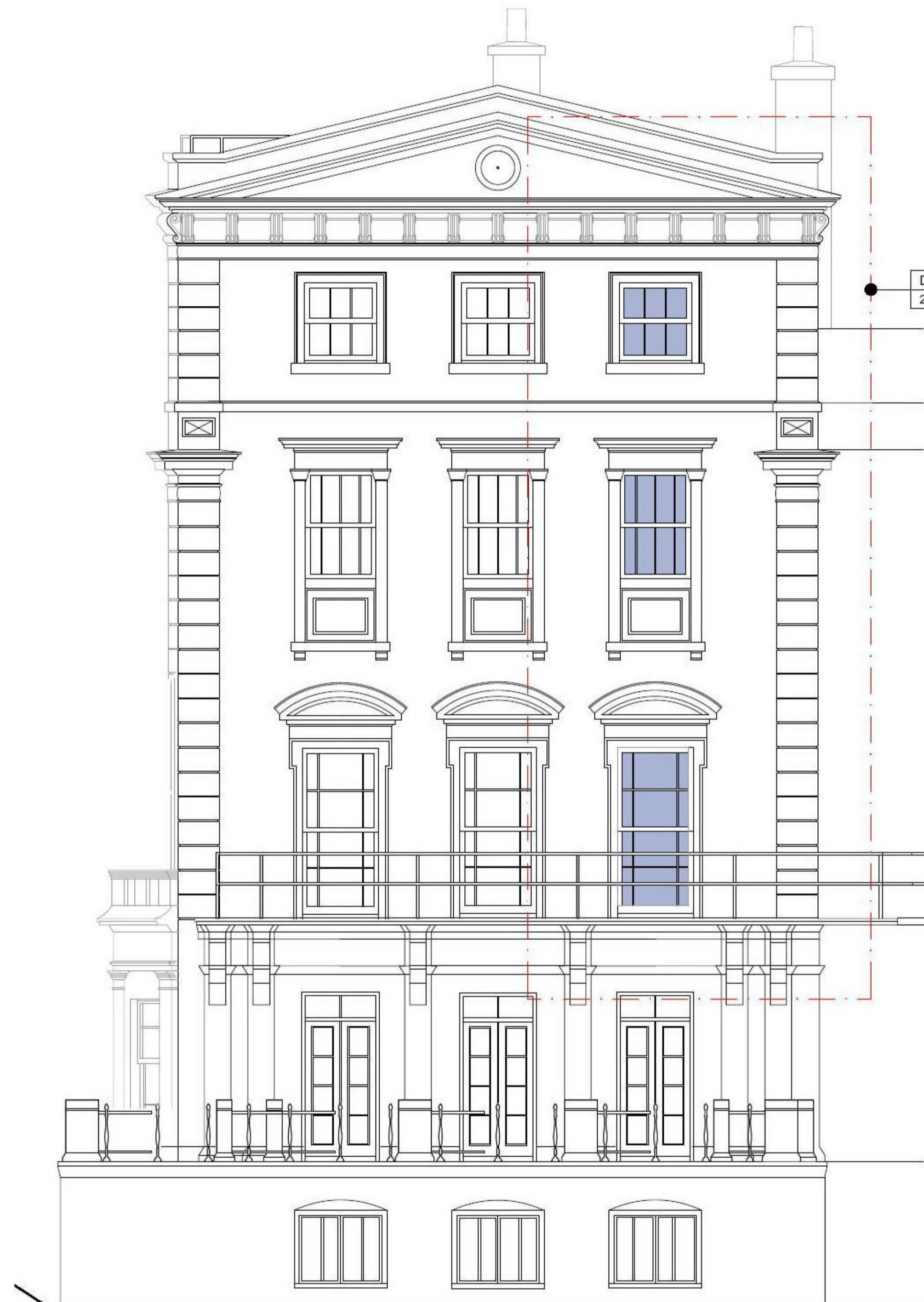
PROPOSED REAR ELEVATION (NORTH ELEVATION) SCALE 1:50 @A1

All materials match the adjacent buildings on the terrace, with matching joinery, plasterwork, decorative elements and ironwork.