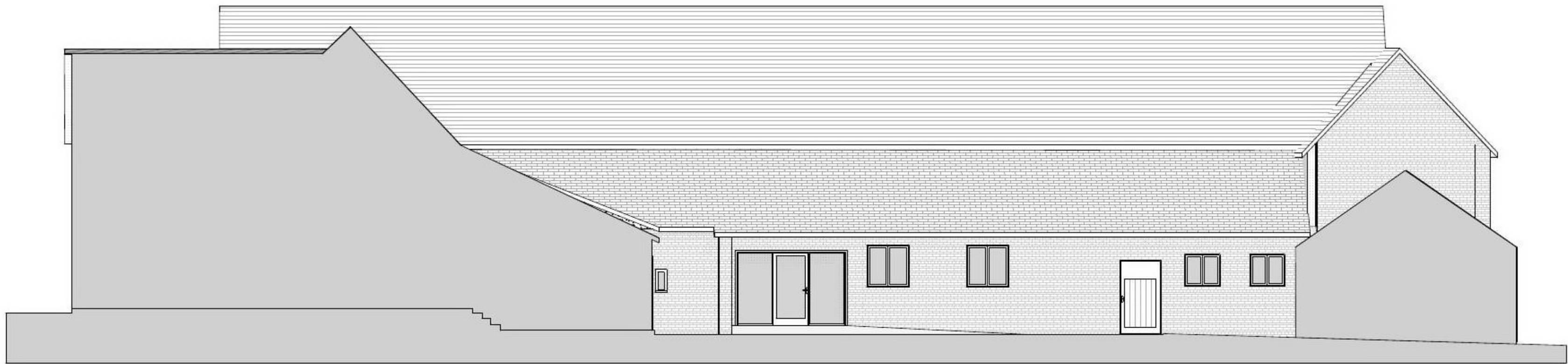
SOUTH COURTYARD ELEVATION