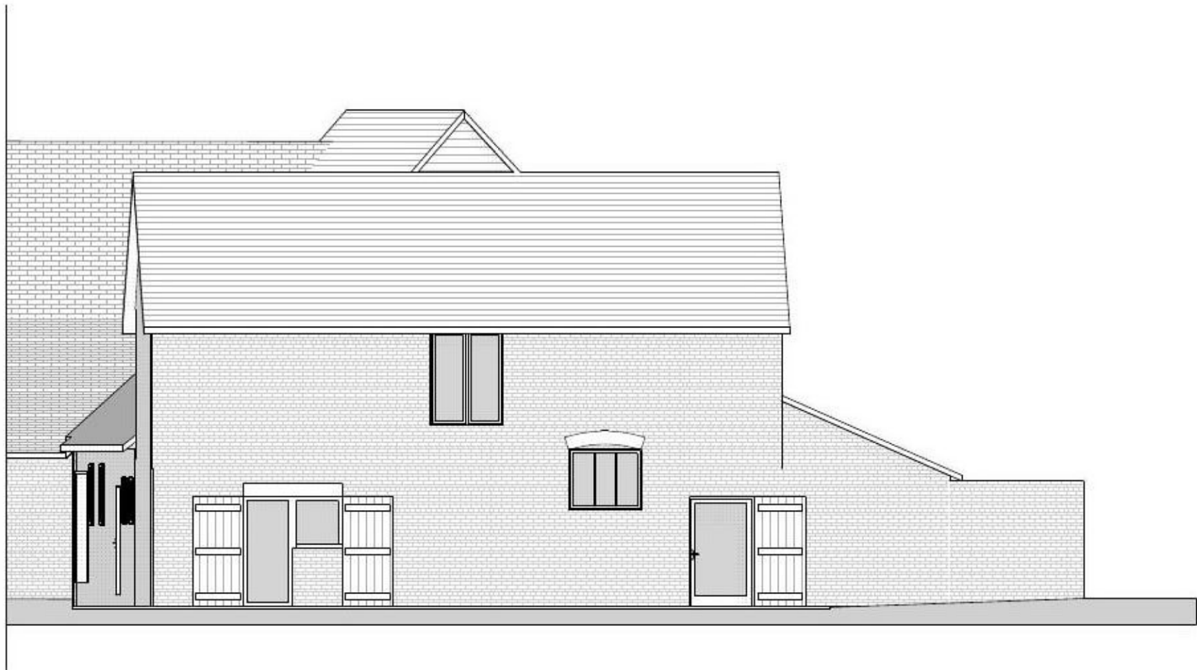
PART EAST ELEVATION (1)