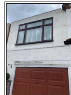
Existing build condition