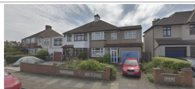
Existing street views