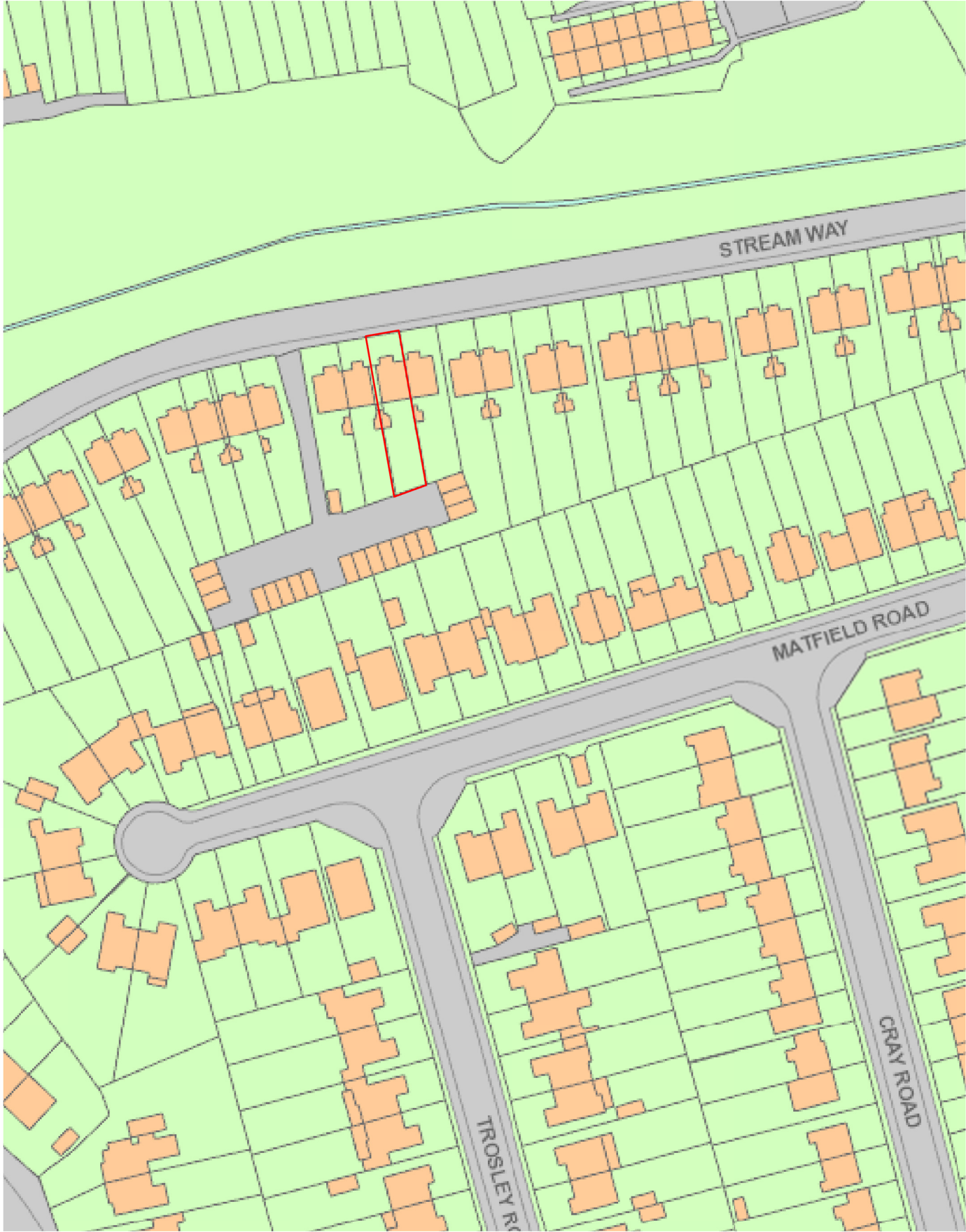
BLOCK PLAN 1 : 500 @A3