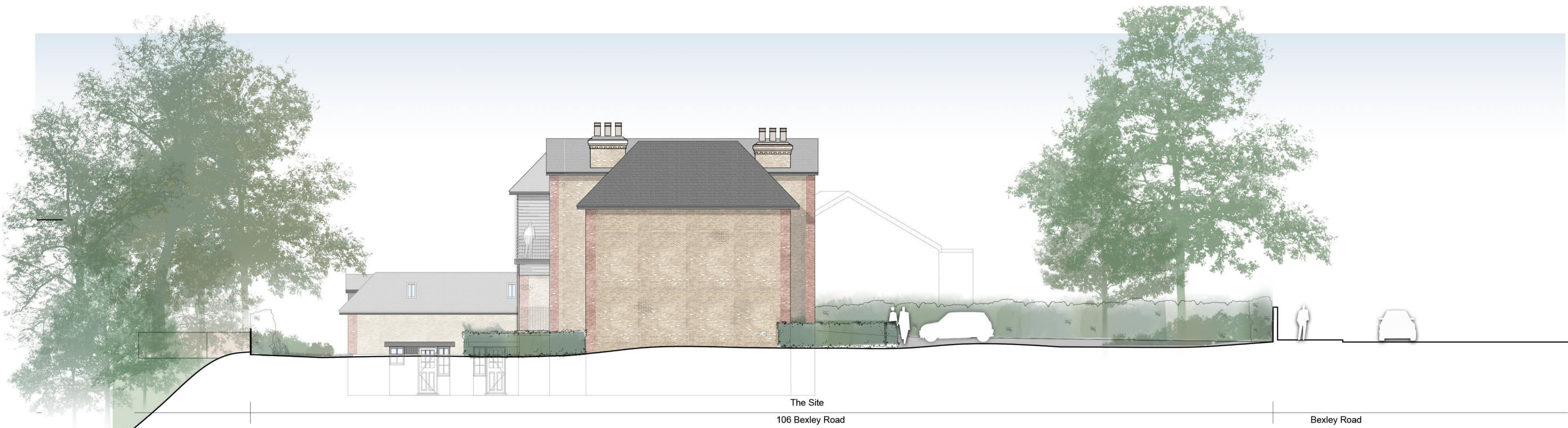
APPROVED ELEVATION SCALE 1:100