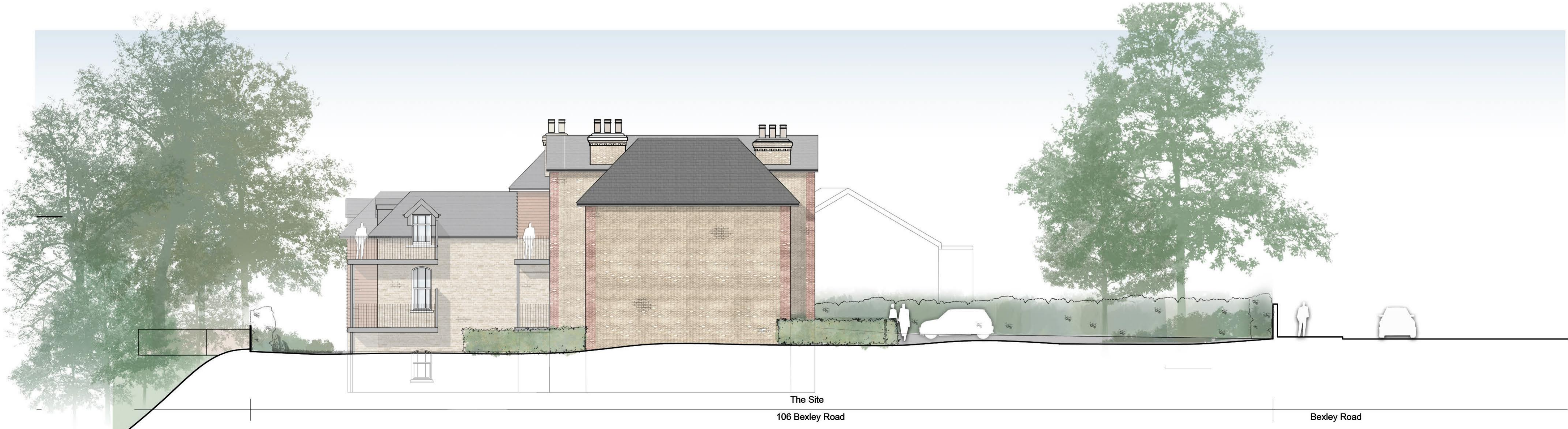
PROPOSED ELEVATION SCALE 1:100