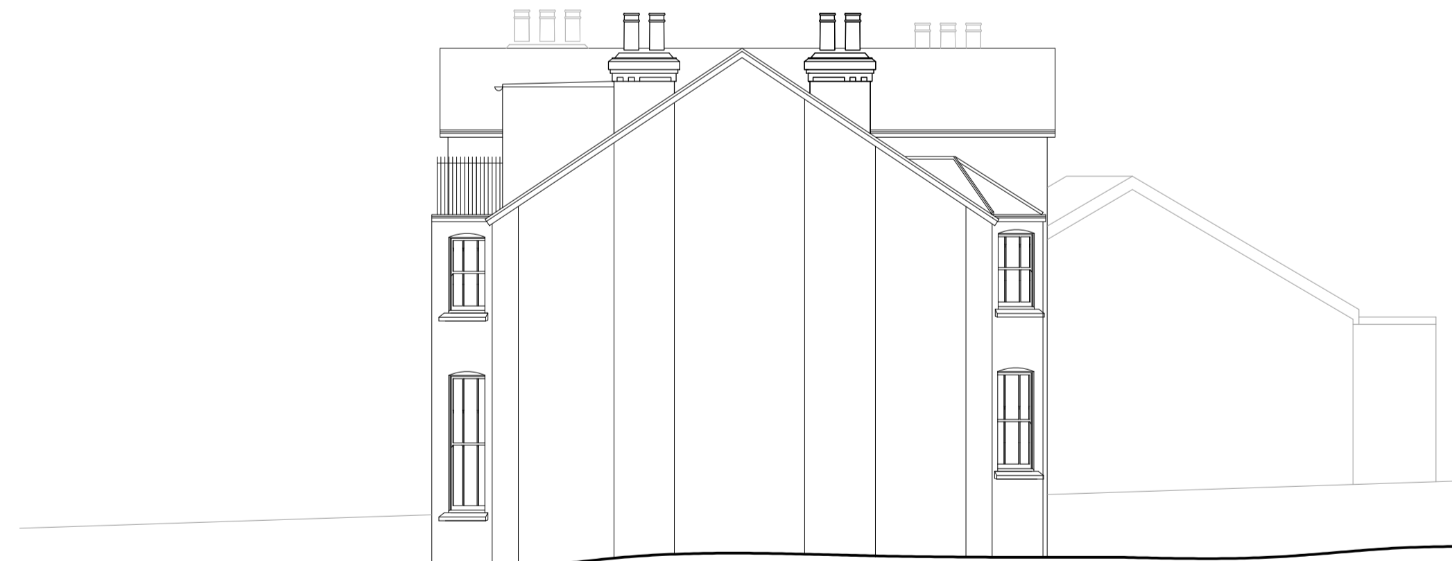
The Site 106 Bexley Road