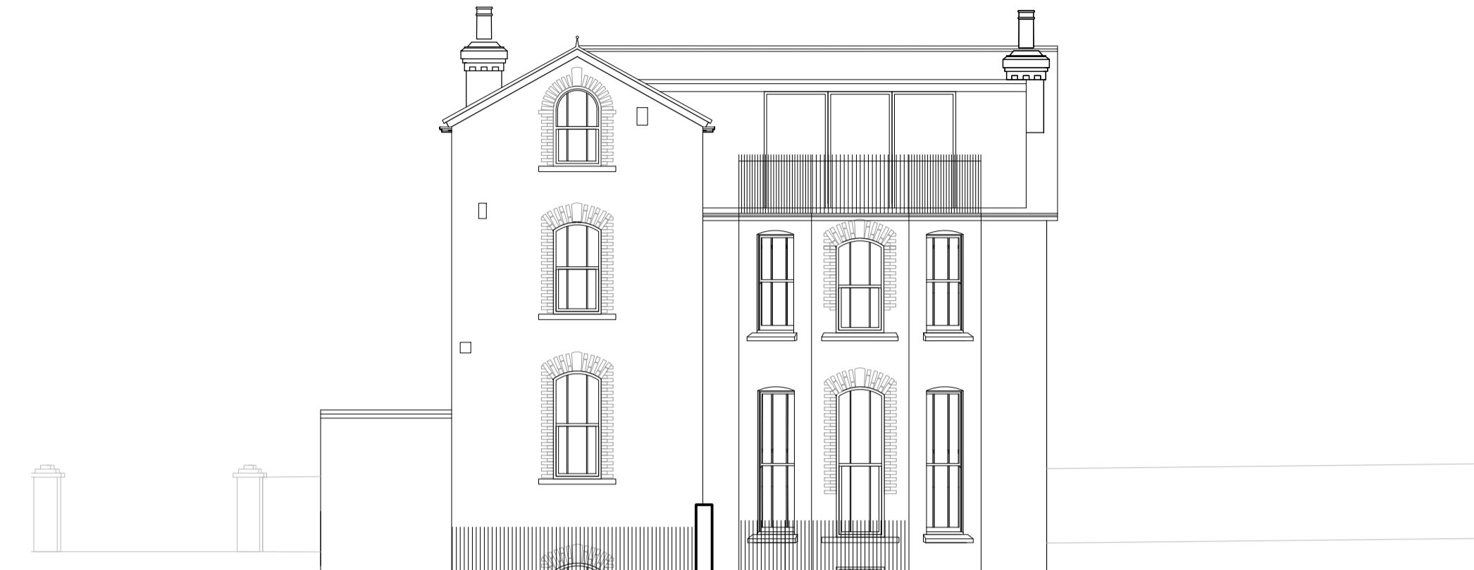
The Site 106 Bexley Road