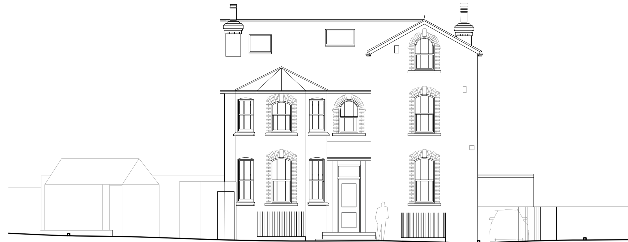
The Site 106 Bexley Road