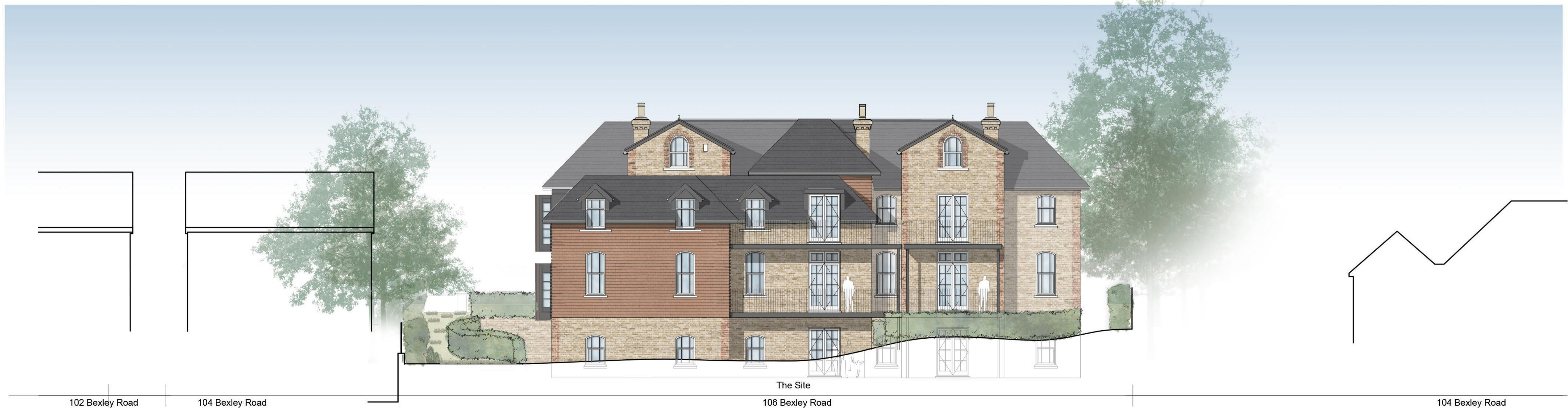
PROPOSED ELEVATION SCALE 1:100

Extension and Conversion of Existing Building At 106 Bexley Road, ERITH, DA8 3SP Approved and Proposed Elevations Rear Elevation - North