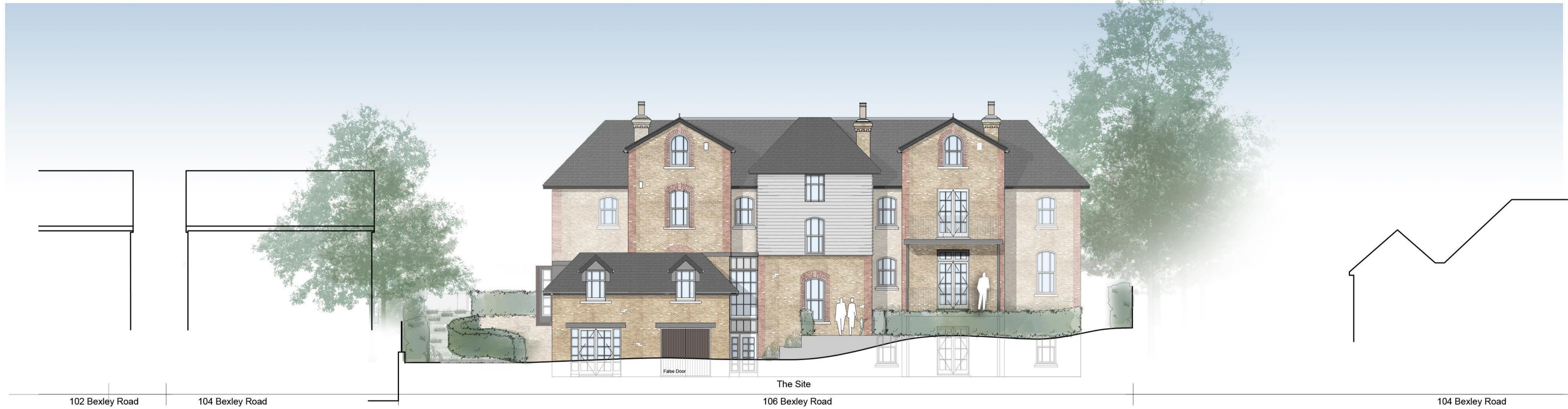
APPROVED ELEVATION SCALE 1:100