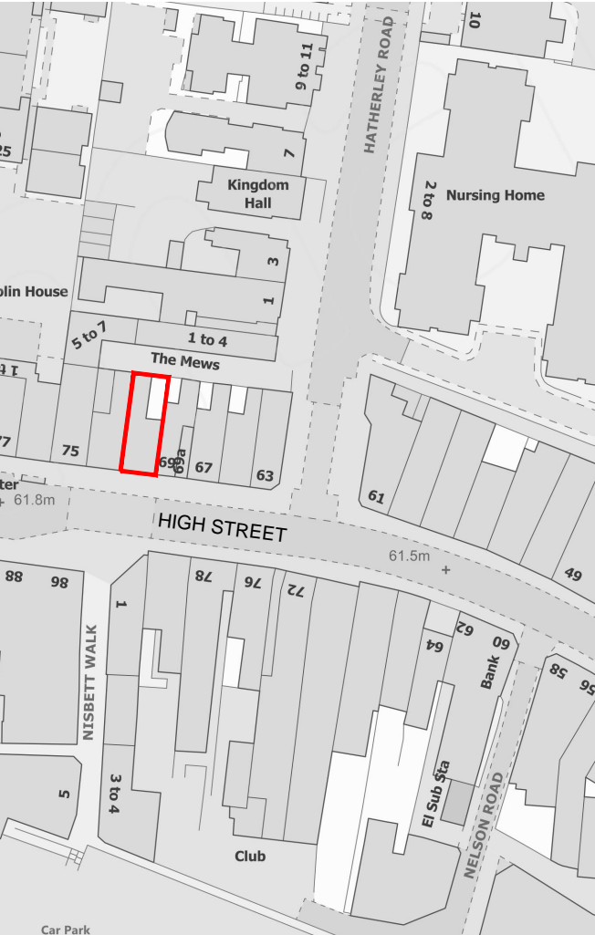
LOCATION PLAN - SCALE 1:1250