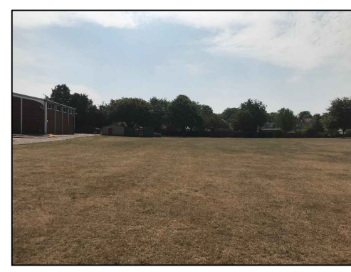
Proposed Site for Sports Hall