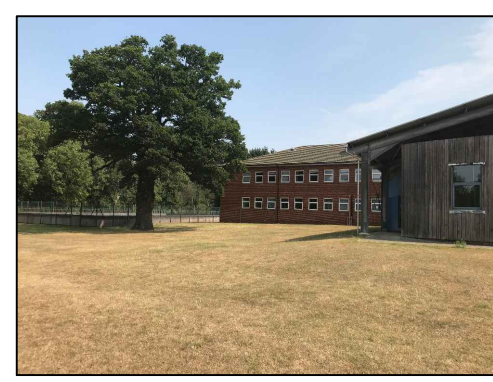
Proposed site for Groundsman Store