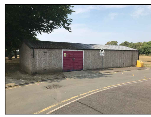
Existing Groundsman Store