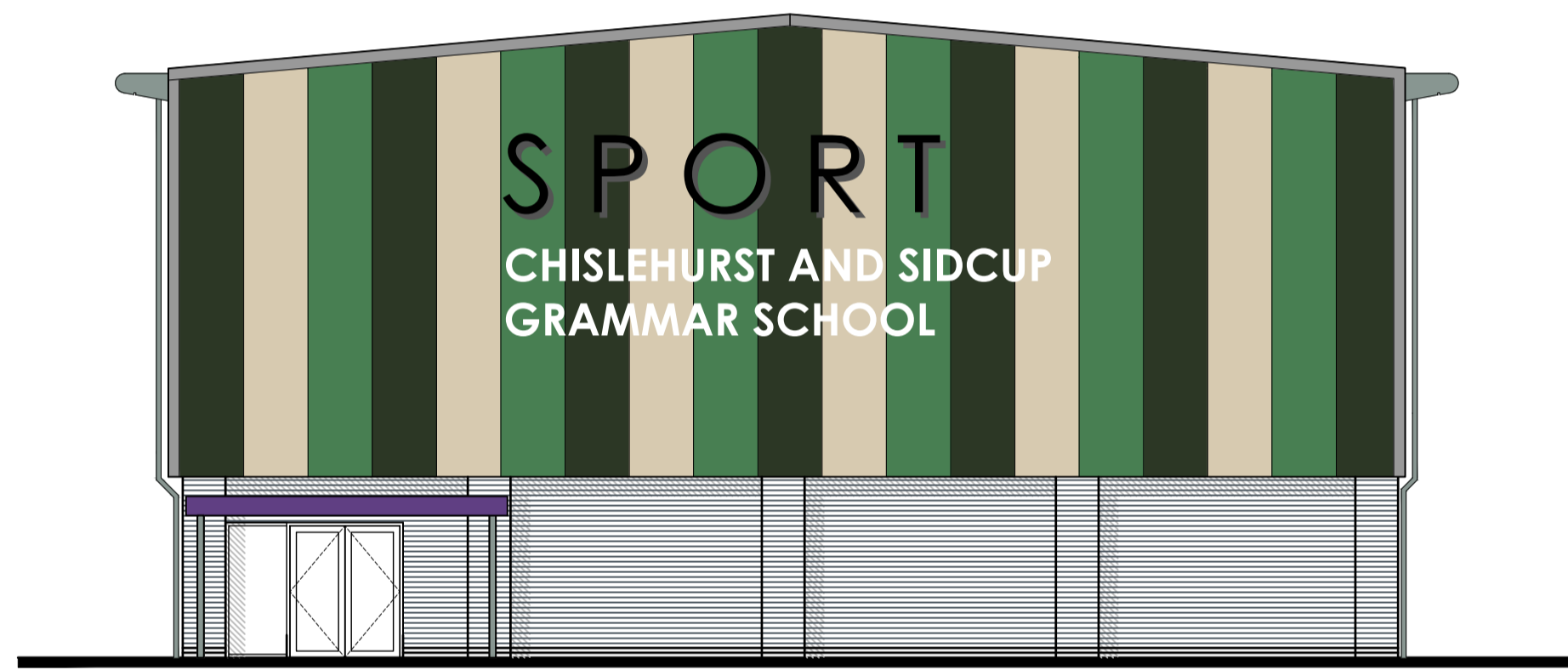
Proposed North Facing Elevation @ 1:100