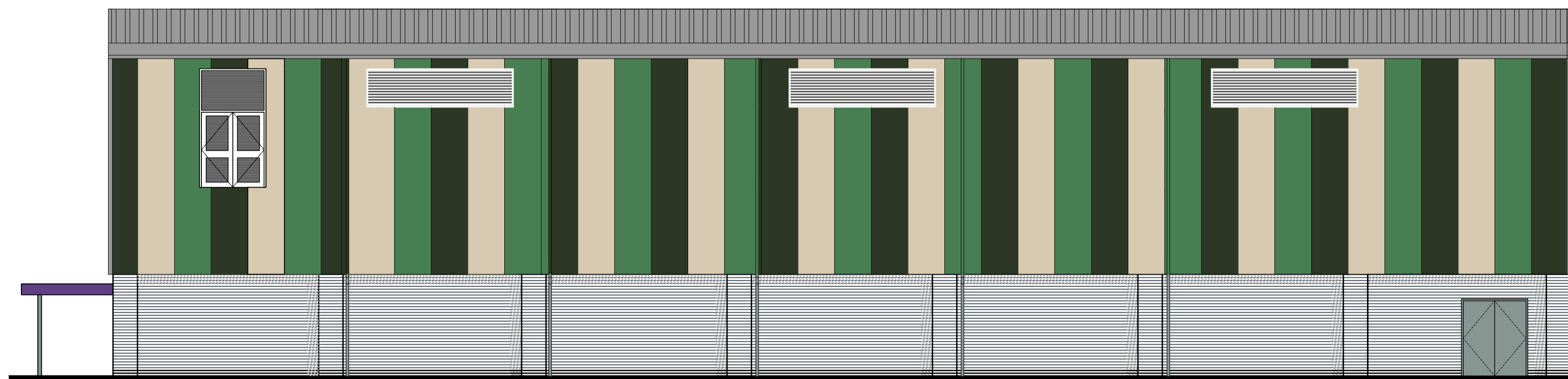
Proposed West Facing Elevation @ 1:100