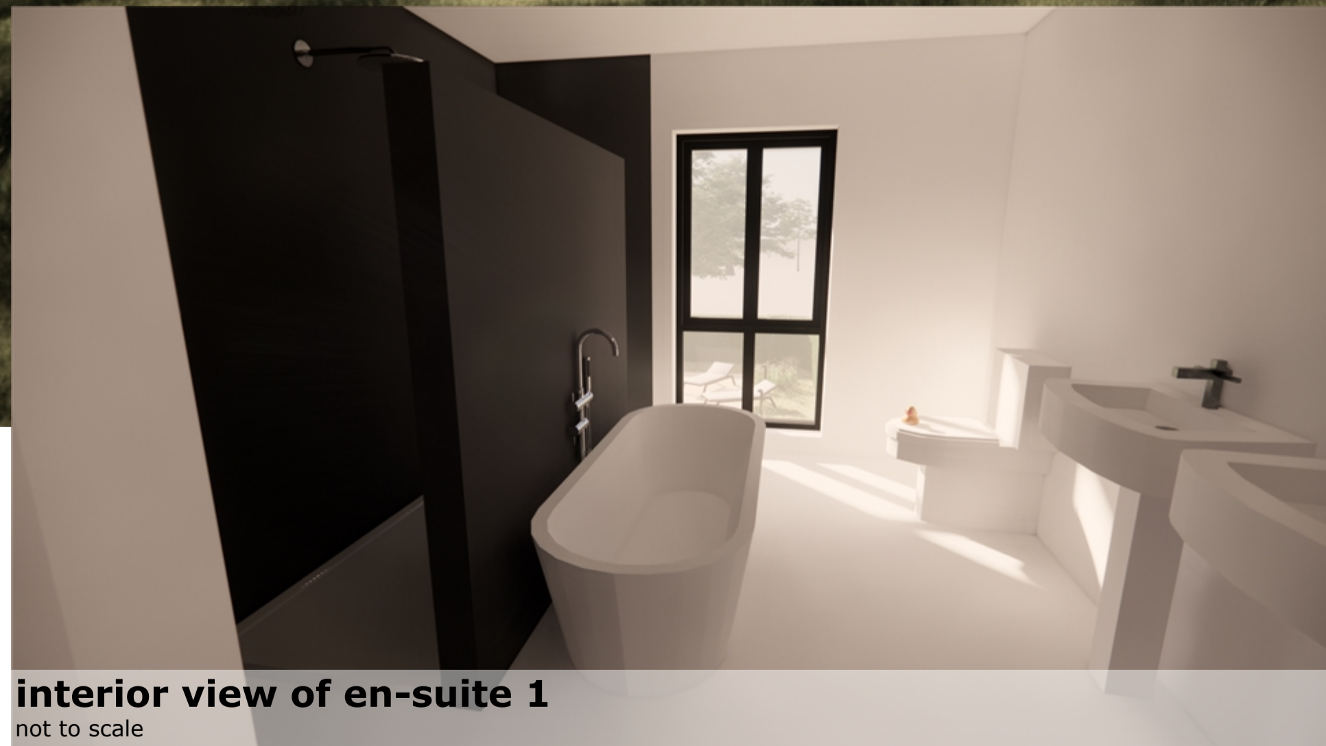
interior view of en-suite 1 not to scale