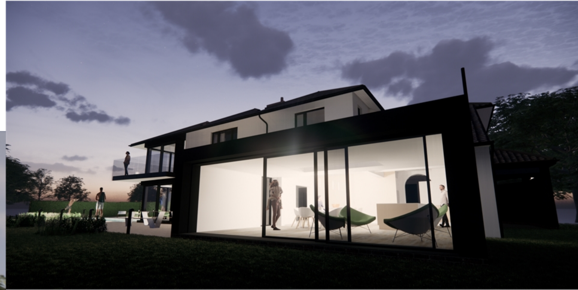
evening view of kitchen/dining extension not to scale