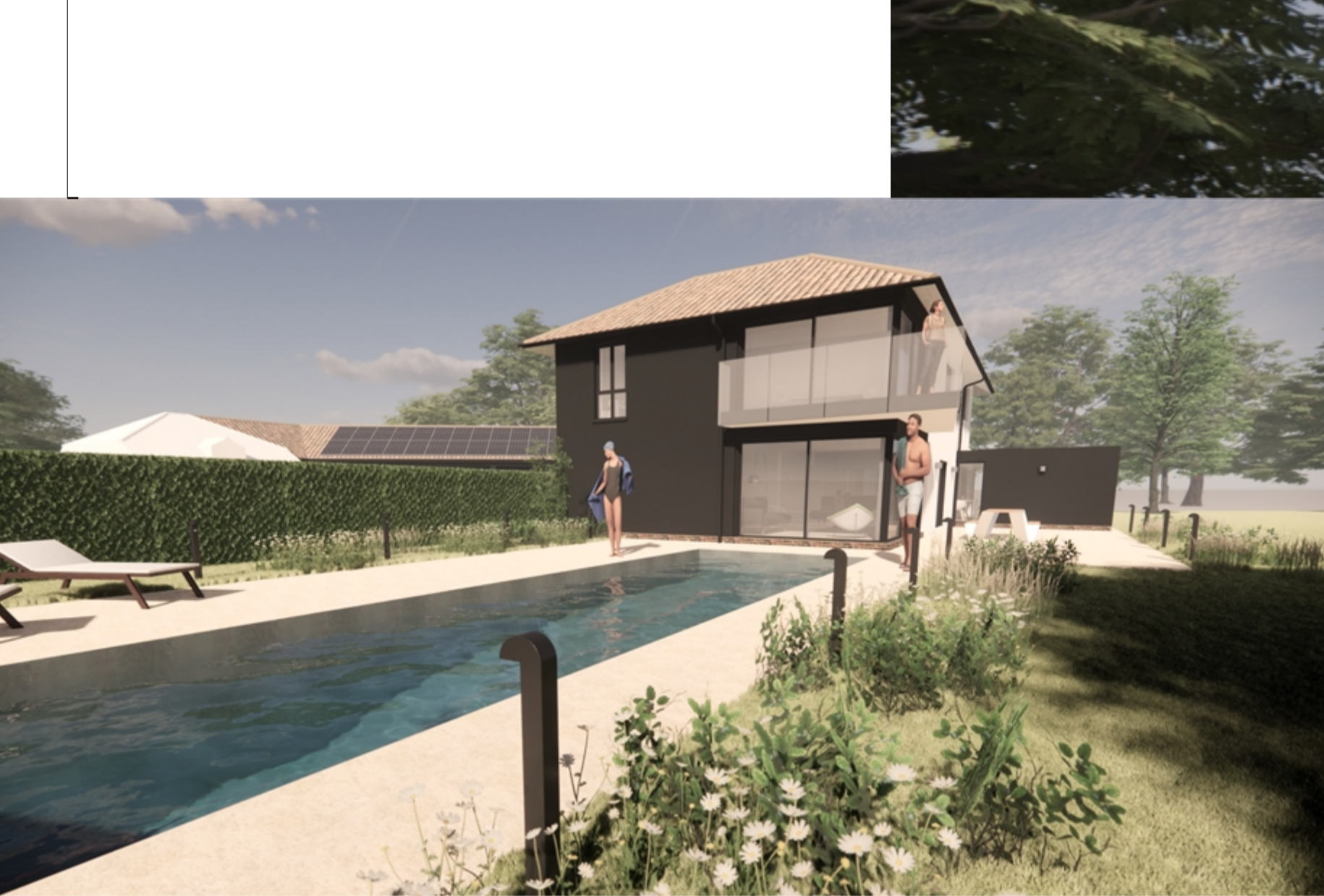
perspective view of 2-storey extension and pool not to scale