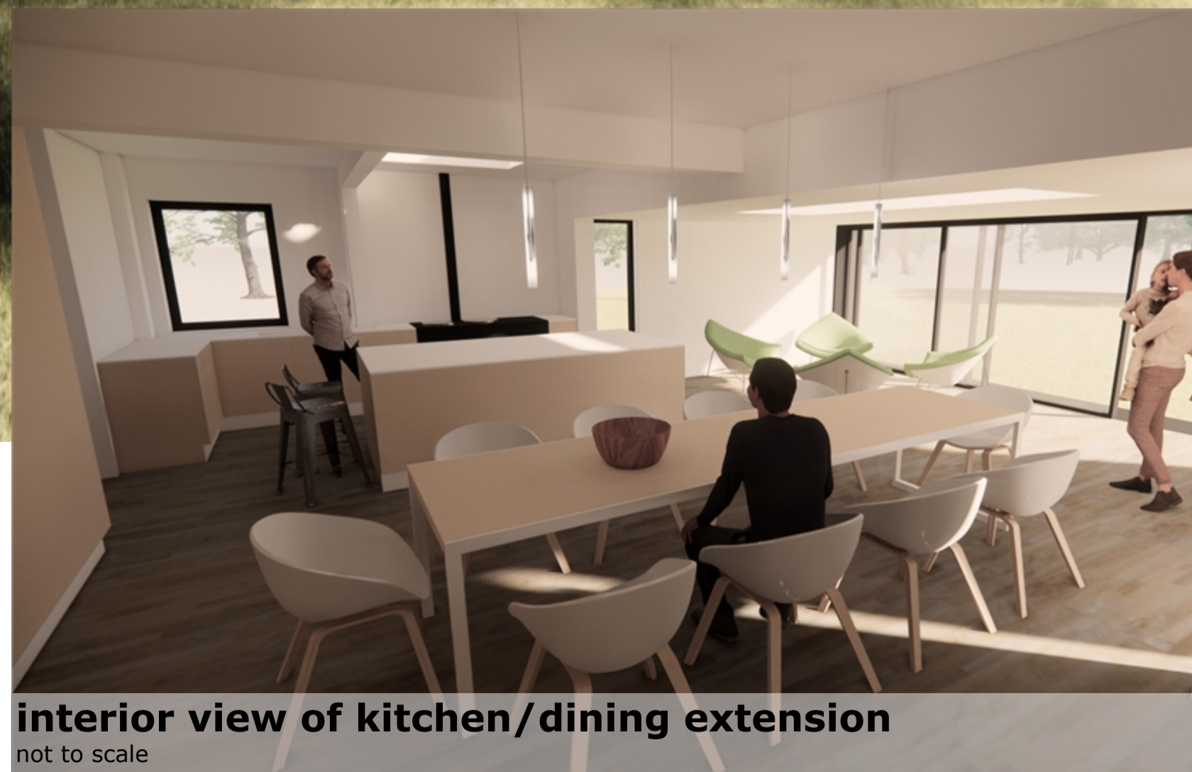
interior view of kitchen/dining extension not to scale

revB: cladding reverts to render, kitchen extension depth increased revA: boarding darkened in colour, misc amendments to client preference