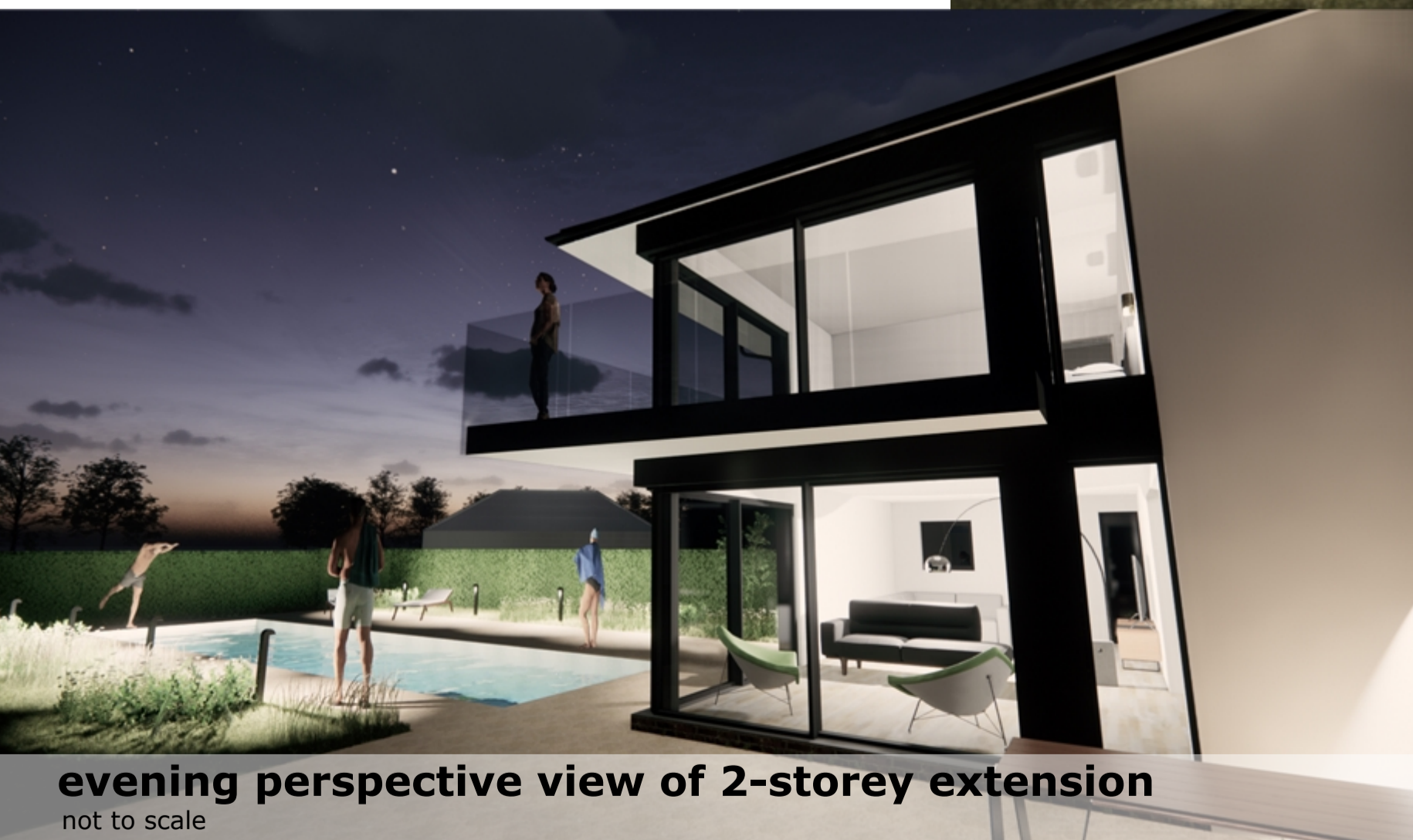
evening perspective view of 2-storey extension not to scale