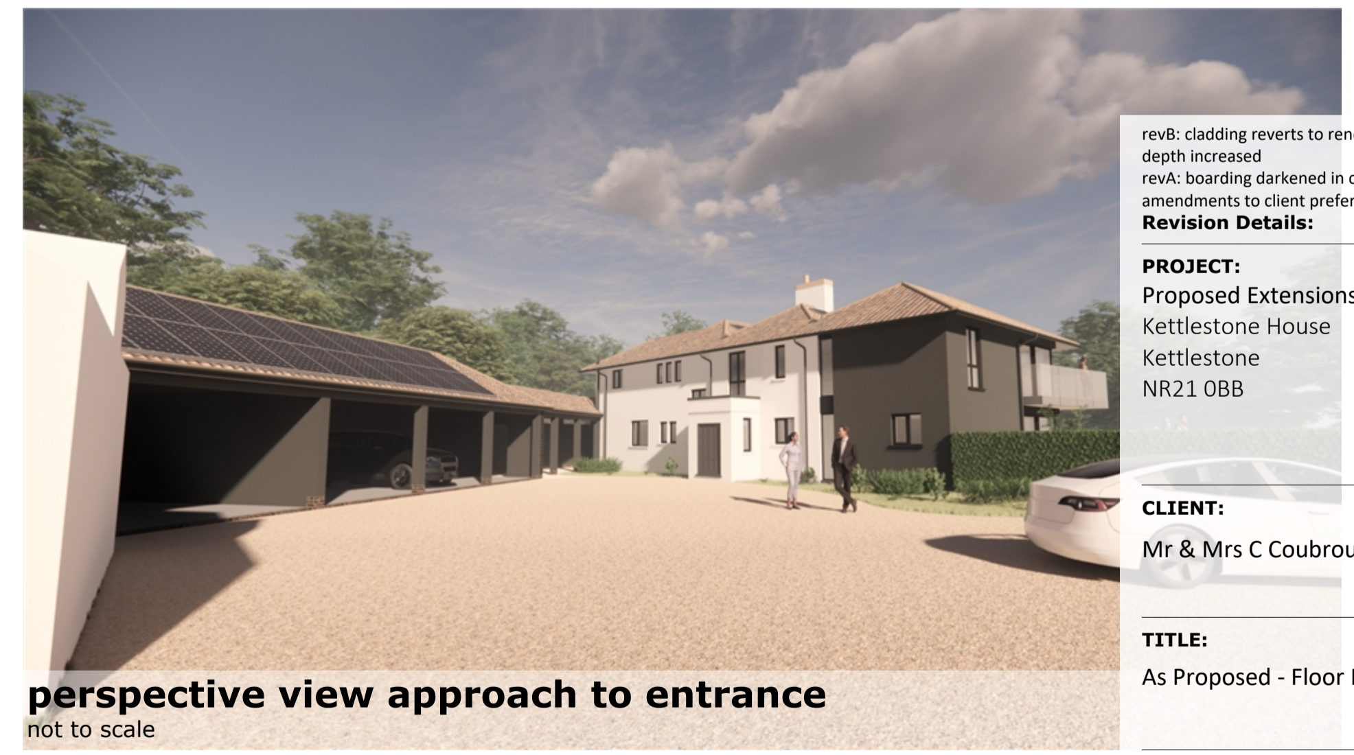
perspective view approach to entrance not to scale

revB: cladding reverts to render, kitchen extension depth increased revA: boarding darkened in colour, misc amendments to client preference Revision Details: