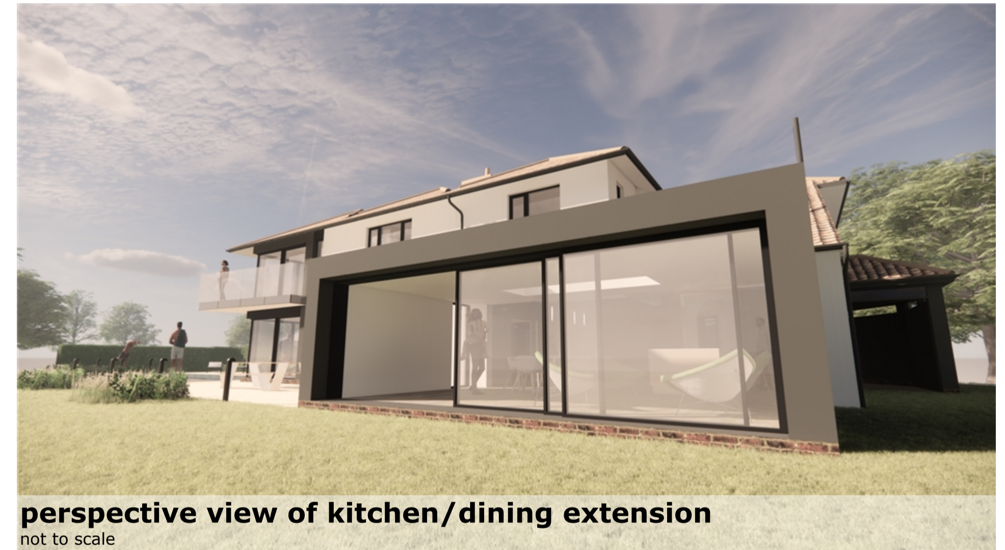
perspective view of kitchen/dining extension not to scale