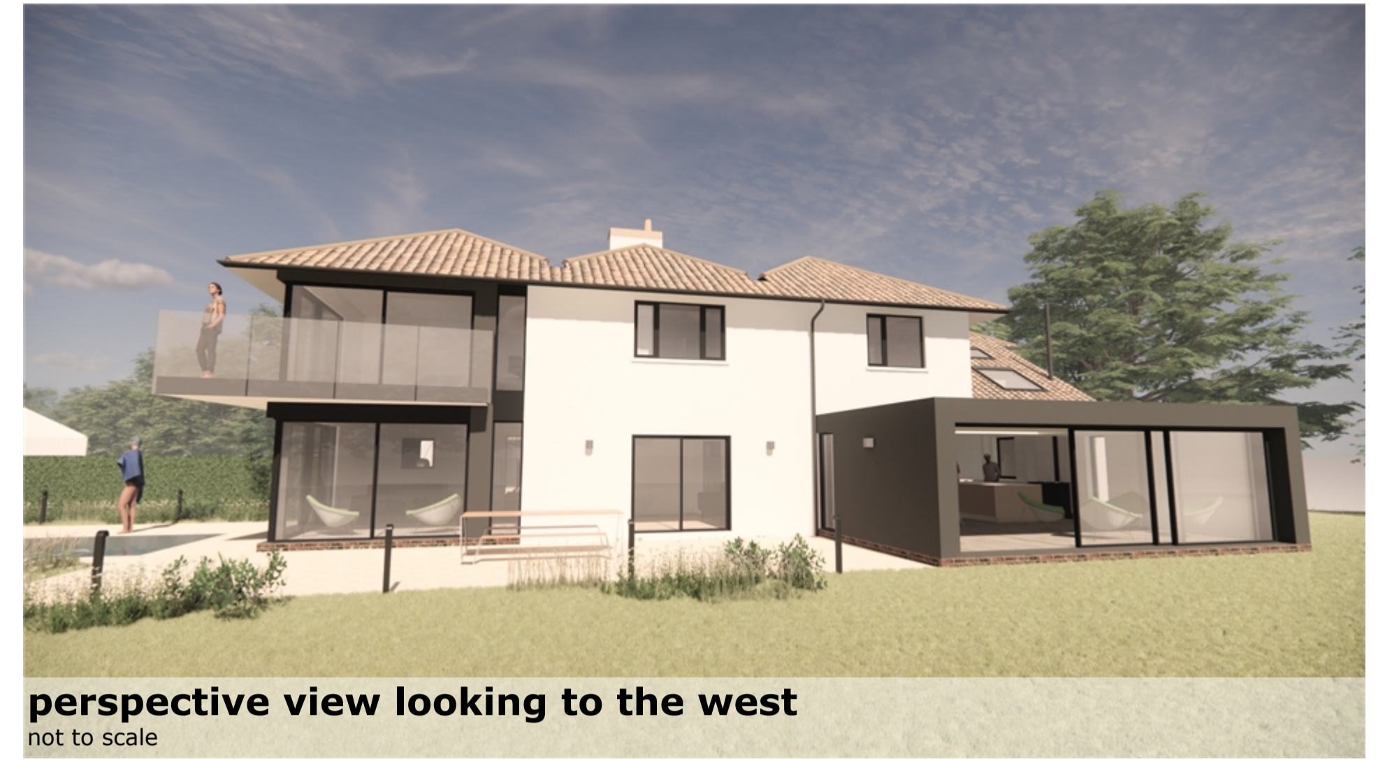
perspective view looking to the west not to scale