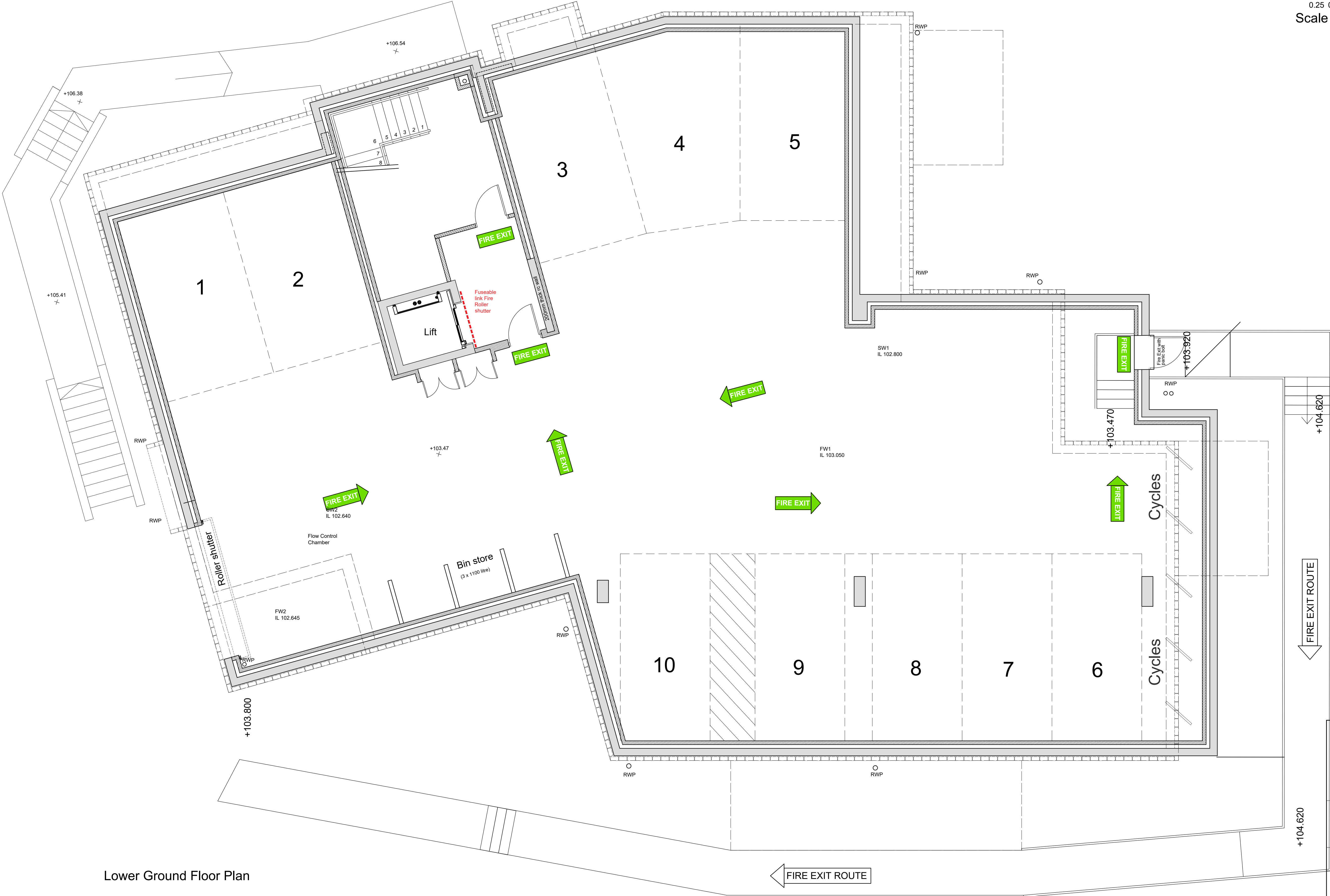
Lower Ground Floor Plan