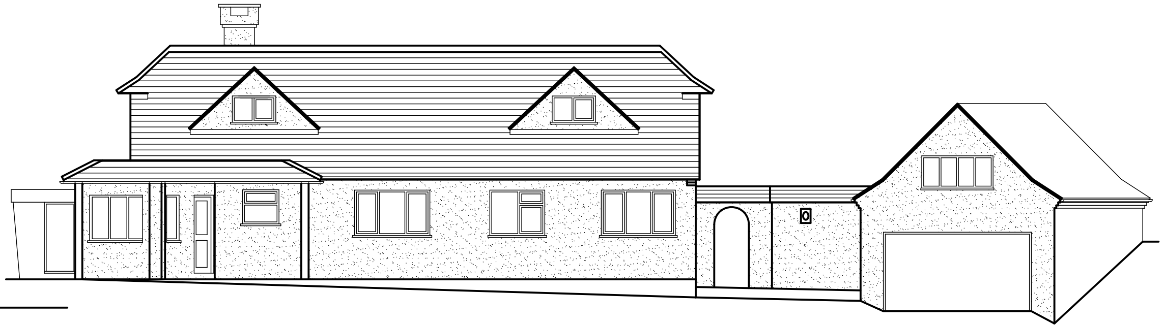
02 EXISTING SOUTH ELEVATION