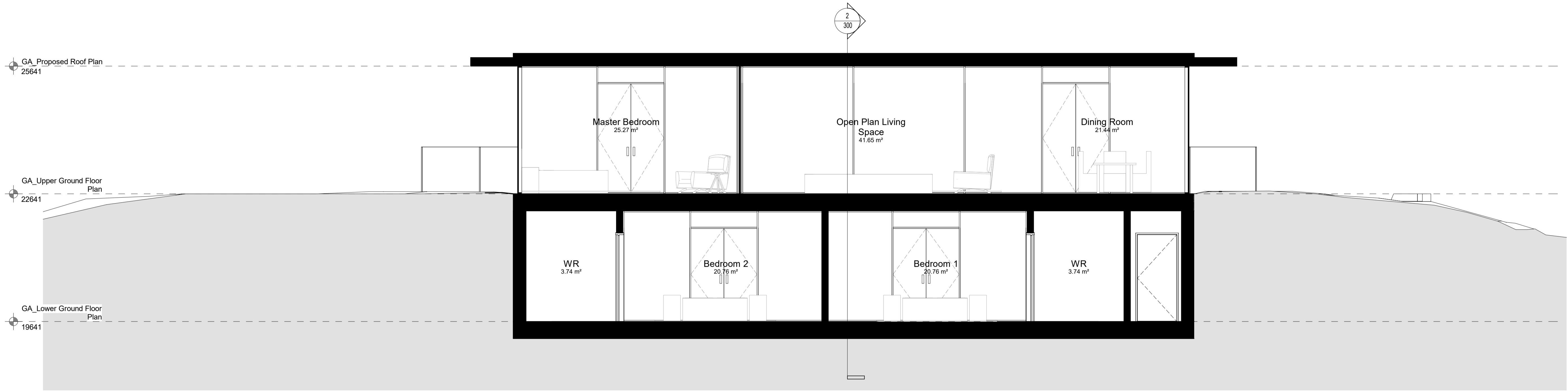
1 Section A-A 300 Scale - 1 : 50