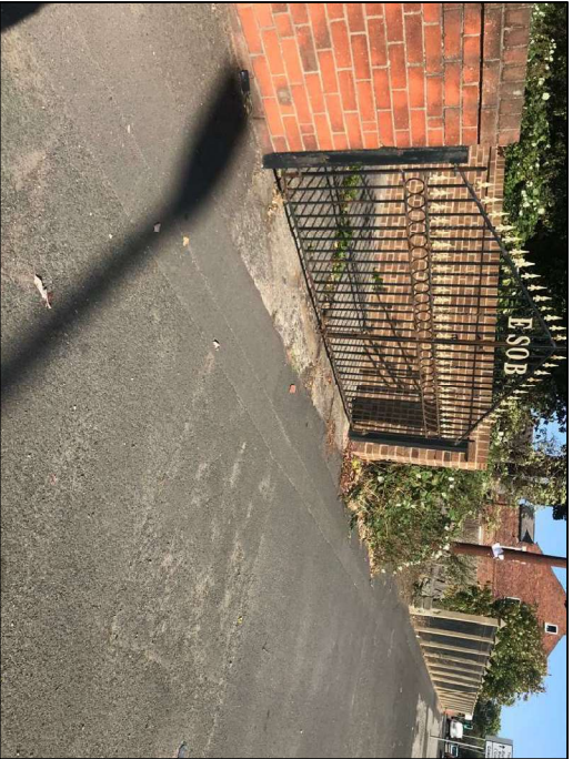
Main Vehicular Exit