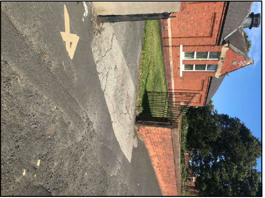
Main Vehicular Entrance