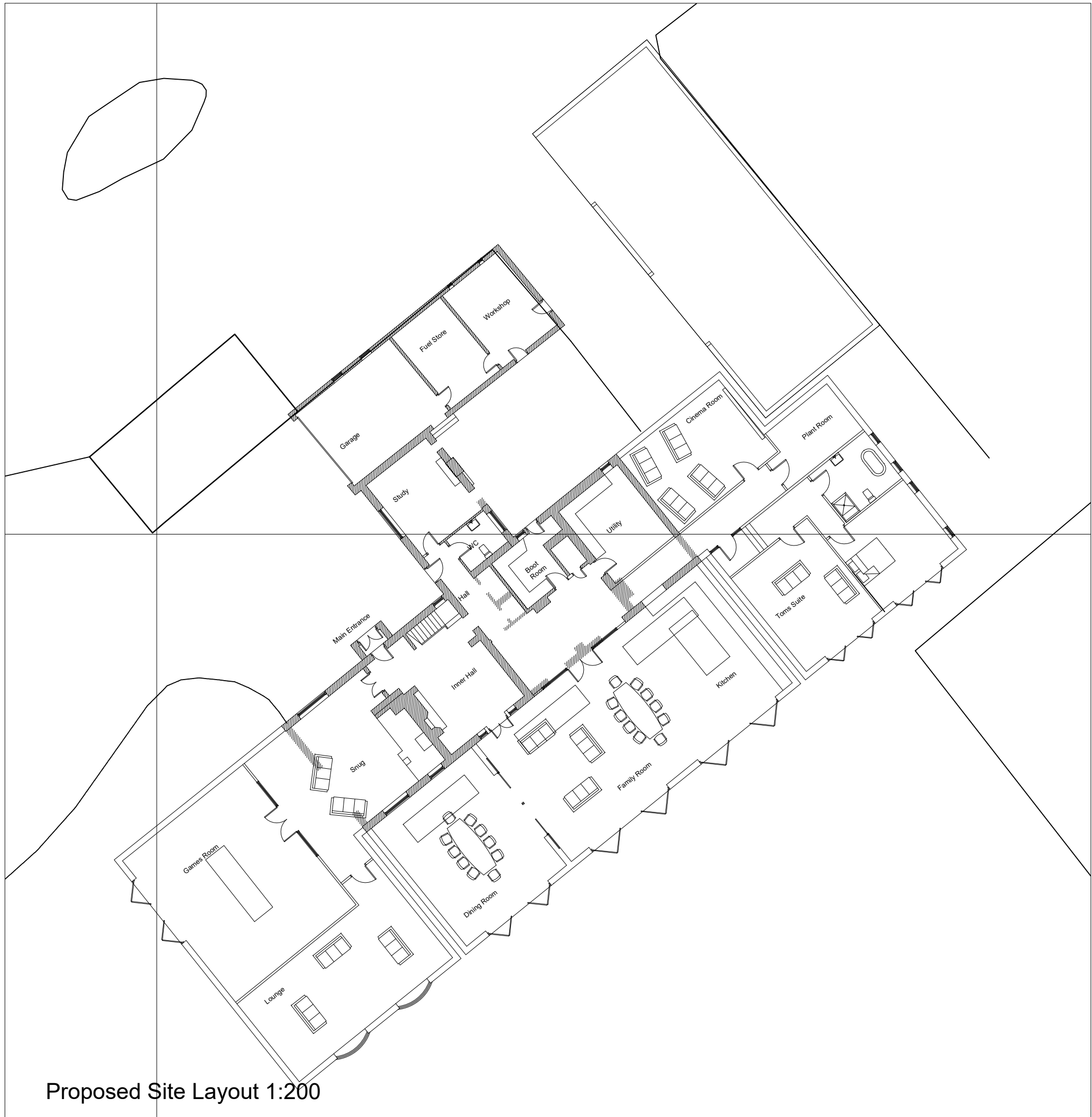
Proposed Site Layout 1:200

NOTES DO NOT SCALE FROM THIS DRAWING. It is the Contractor's responsibility to check all governing dimensions and verify all dimensions on site before commencing any work or making any shop drawings. This drawing is to be read in conjunction with schedules of work, specifications, bills of quantities and other relevant information. Any discrepancies are to be reported to the Project Architect. Work and materials are to be in accordance with the Building Regulations and to comply with the relevant British Standards. This drawing is copyright of Mark Brotherton Ltd and should not be reproduced in whole or part without their written permission.