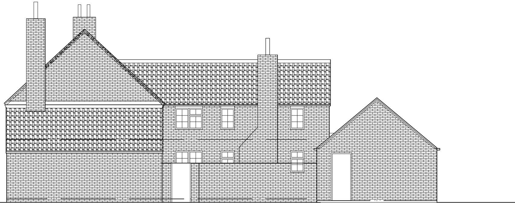
Original East Elevation