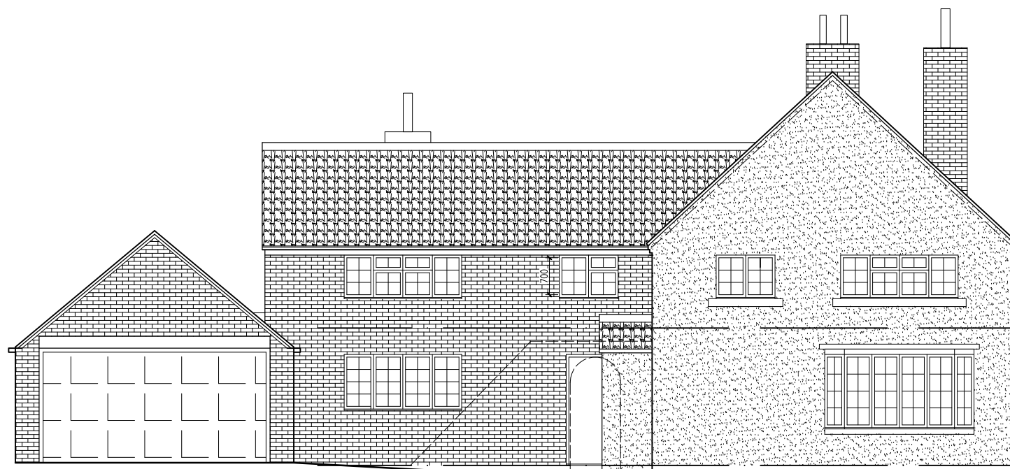
Original West Elevation