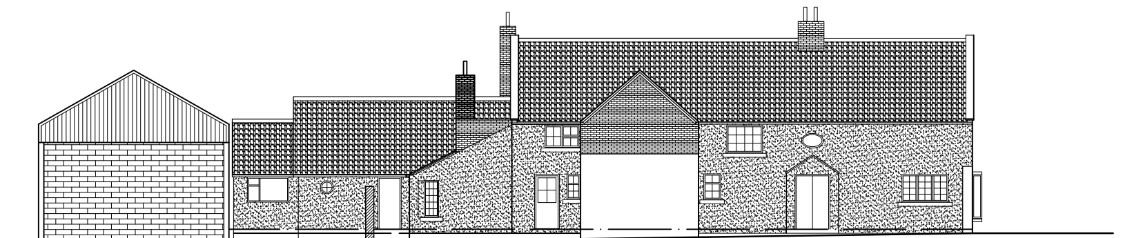
Current North Elevation