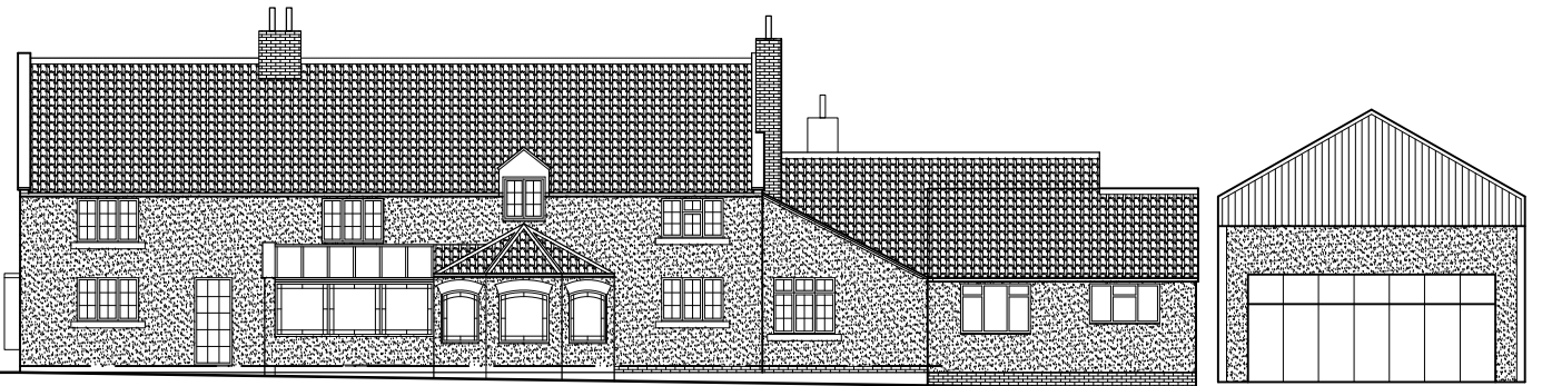
Current South Elevation