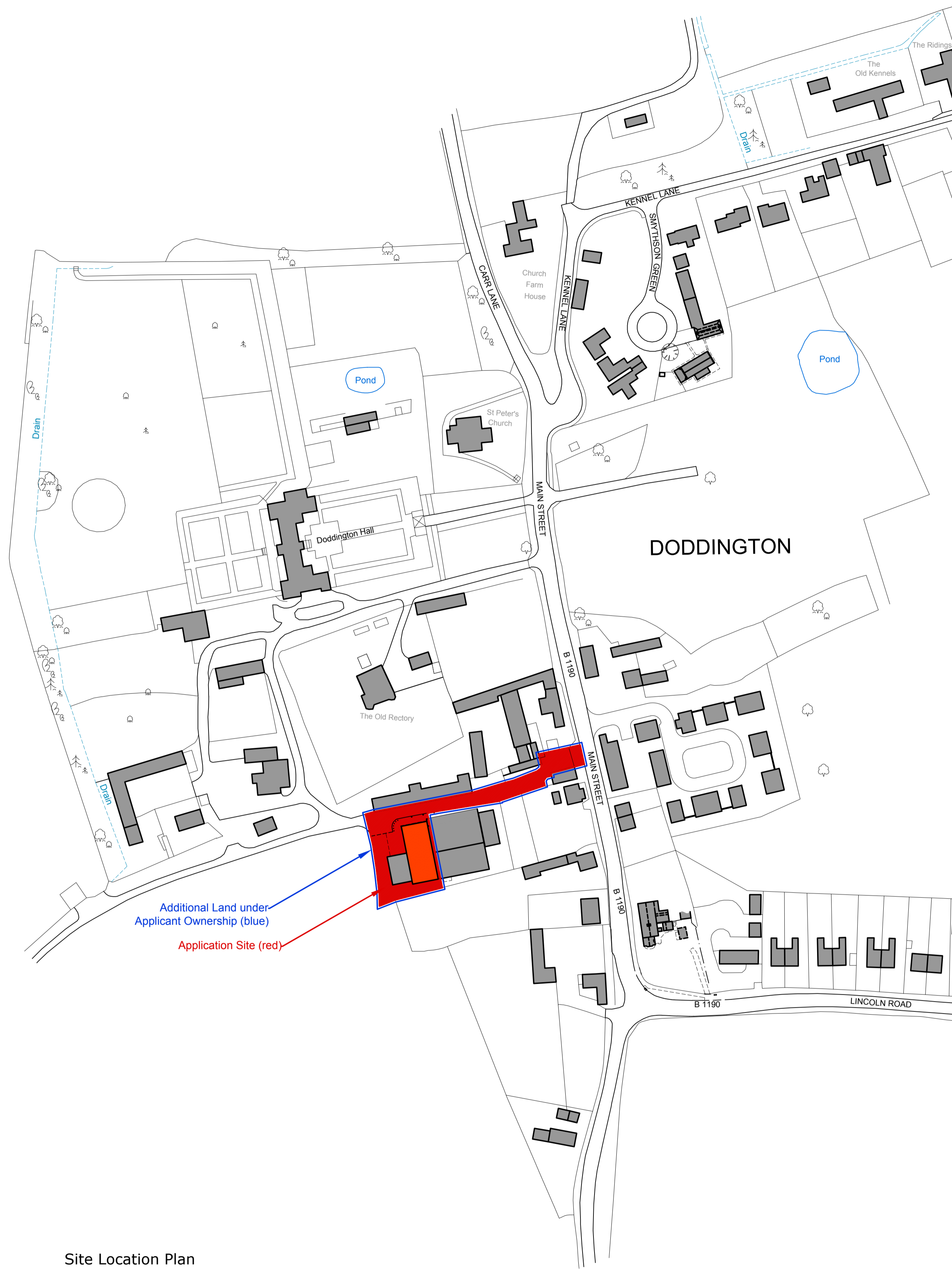
Site Location Plan 1:1250