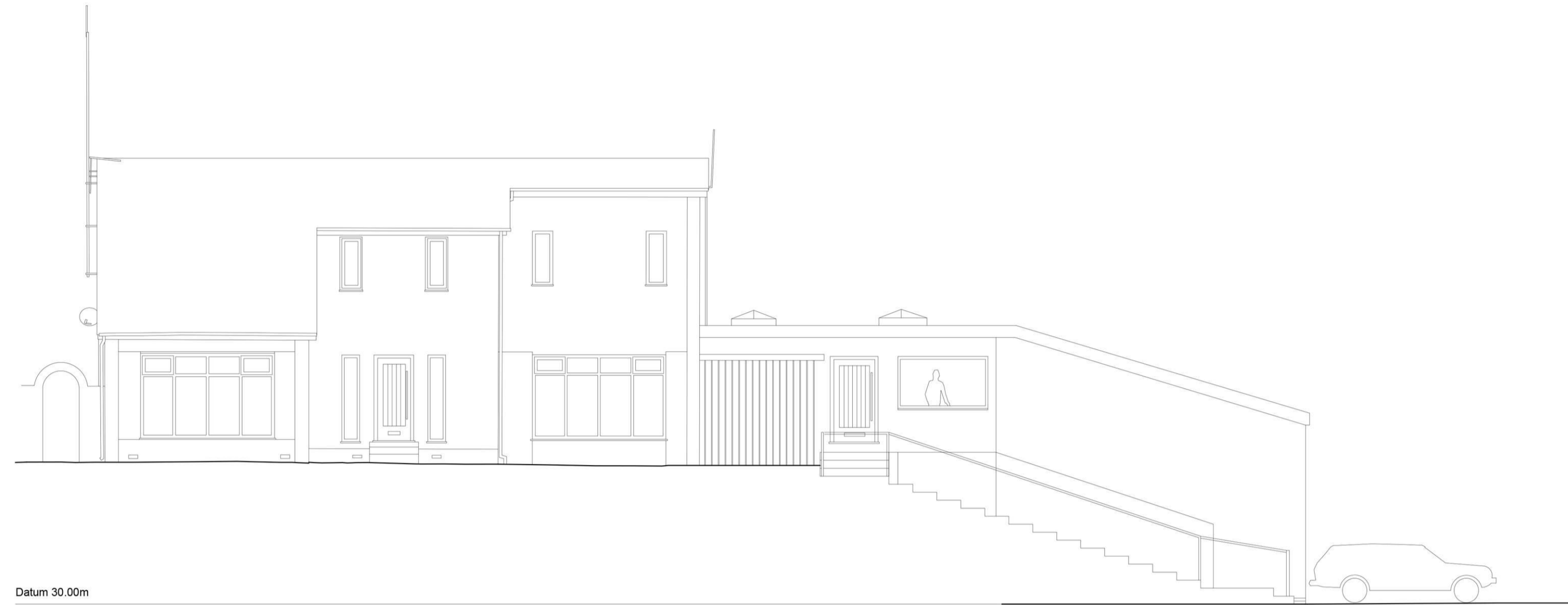
Elevation 01 - a

This drawing must not be scaled. Discrepancies are to be reported to the Architect immediately. All dimensions are approximate and are to be checked on site. All information to be subject to site surveys. This drawing, or any portion of it must not be reproduced without prior consent from the Architect. © Joseph Boniface Architects Ltd