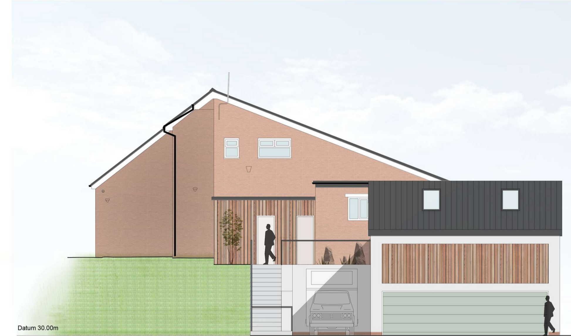
Elevation 02 - a