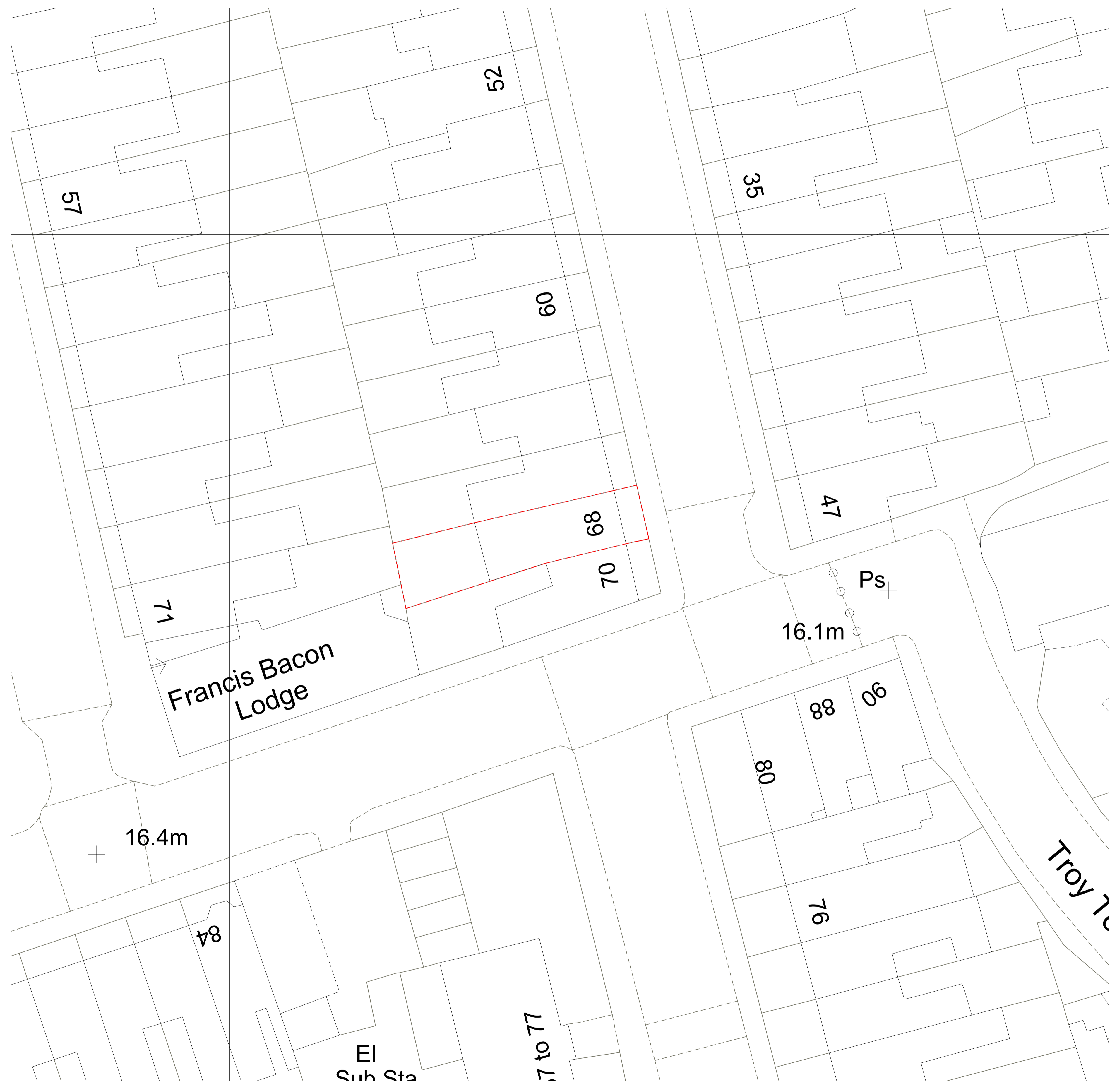
OS PROPOSED LOCATION PLAN 0 2.5 5 10 15 20m 1:200

- For briefing, information, planning, technical design, or tendering purposes ONLY. - Use figured dimensions only. - Do not scale from this drawing. - Issued for purpose indicated only. - All dimensions to be checked on site. - Architect to be notified of any discrepancies before construction commences. - Structural and services information is indicative only - refer to consultants' drawings and specification for details and setting out. - All work and materials to be in accordance with current applicable statutory legislation and to comply with all relevant codes of practice and British and European standards. - Information contained within this drawing is the sole copyright of Turner Architects Ltd. and not to be reproduced without written permission.