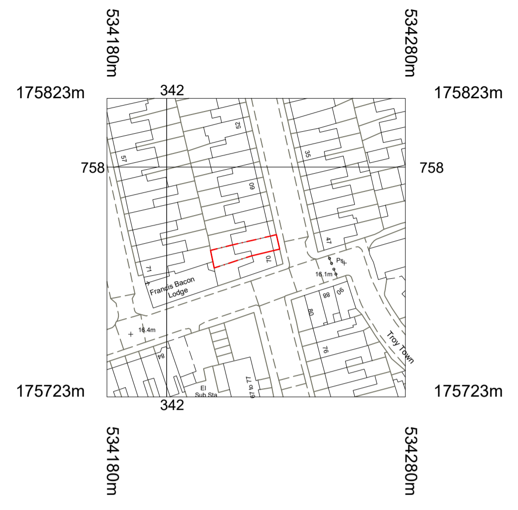
OS EXISTING SITE LOCATION PLAN 0 5 10 20 50 100m 1:1250