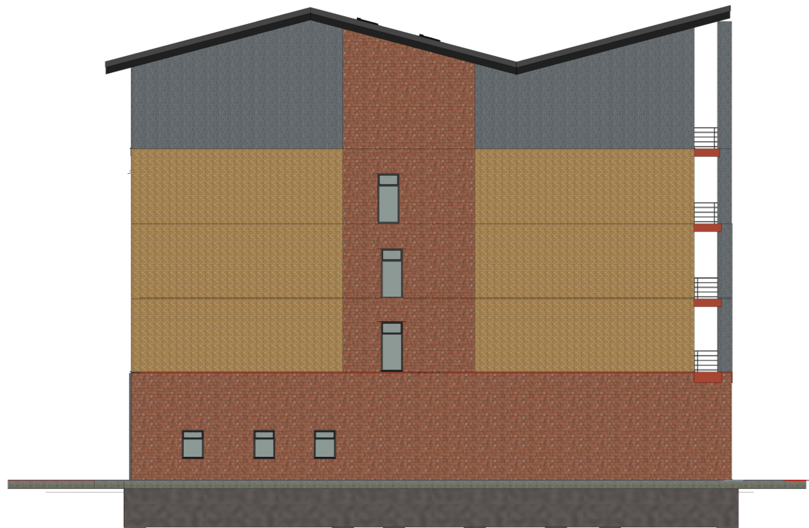
1 South 1 : 100

All drawings are copyrighted to the technician. Reproducing is not permitted without consent