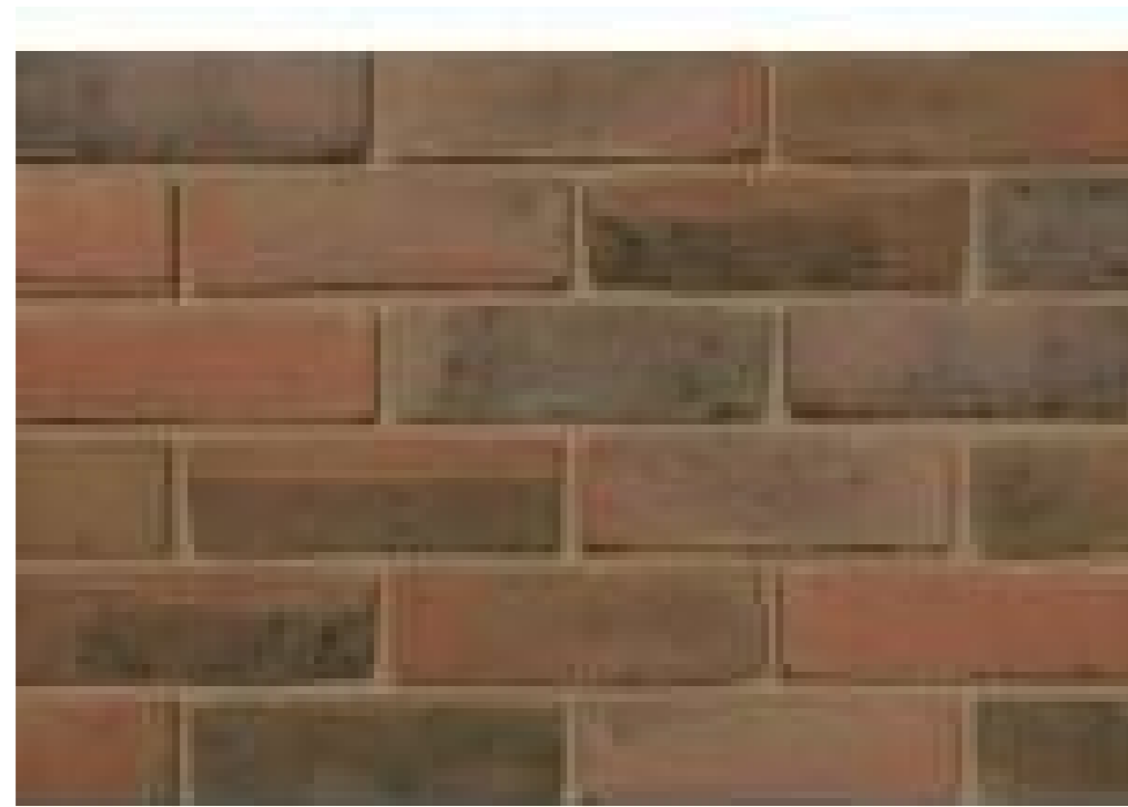
COTTAGE MIX BRICKWORK