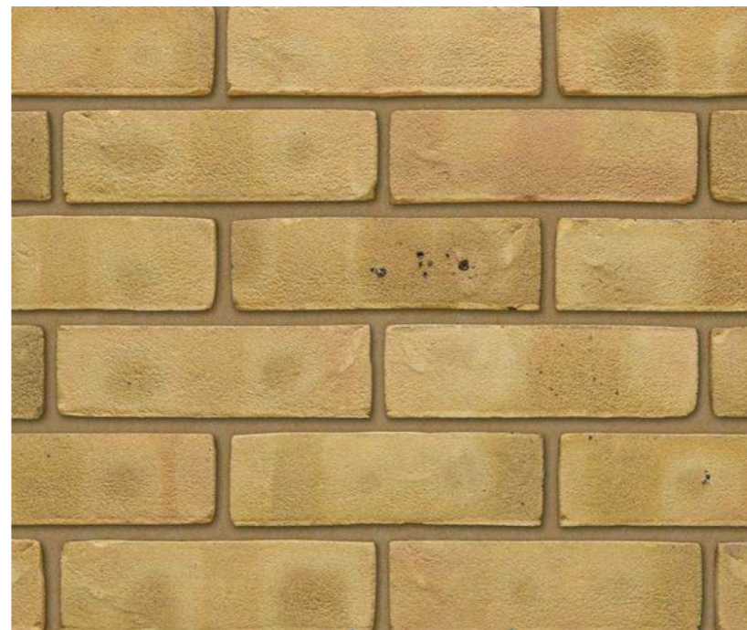
SEVENOALS YELLOW STOCK