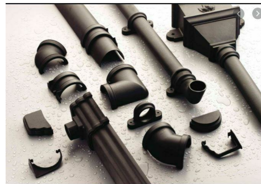
CAST IRON LOOKALIKE RAINWATER GODS