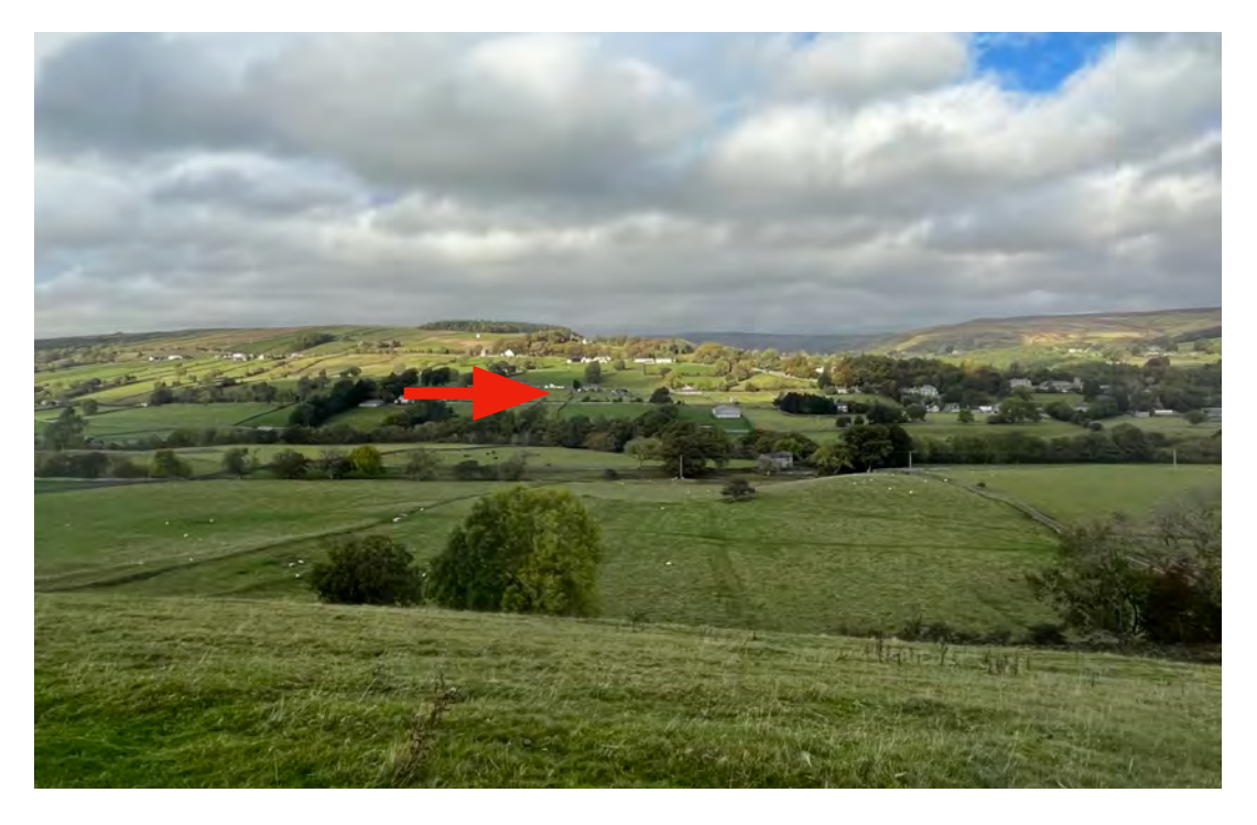
Pic 2 - Old railway line near viewing arch