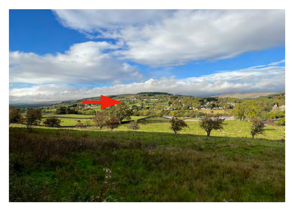
Pic 4 - coming off the fell before walking down the road to MIT