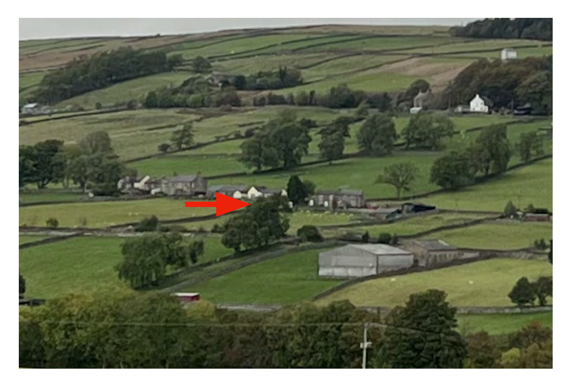
Pic1 - Zoomed in on site