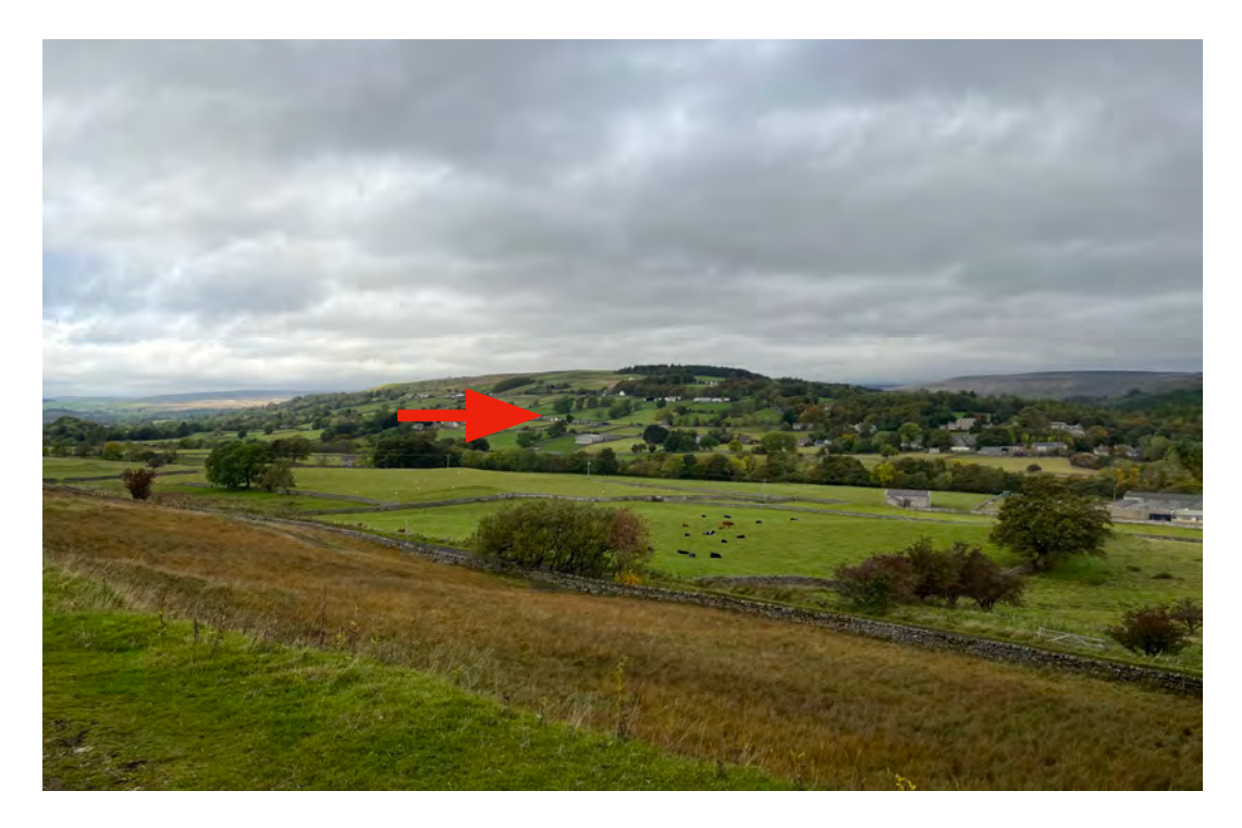
Pic 1 - Old Railway Line / beginning Pennine Way