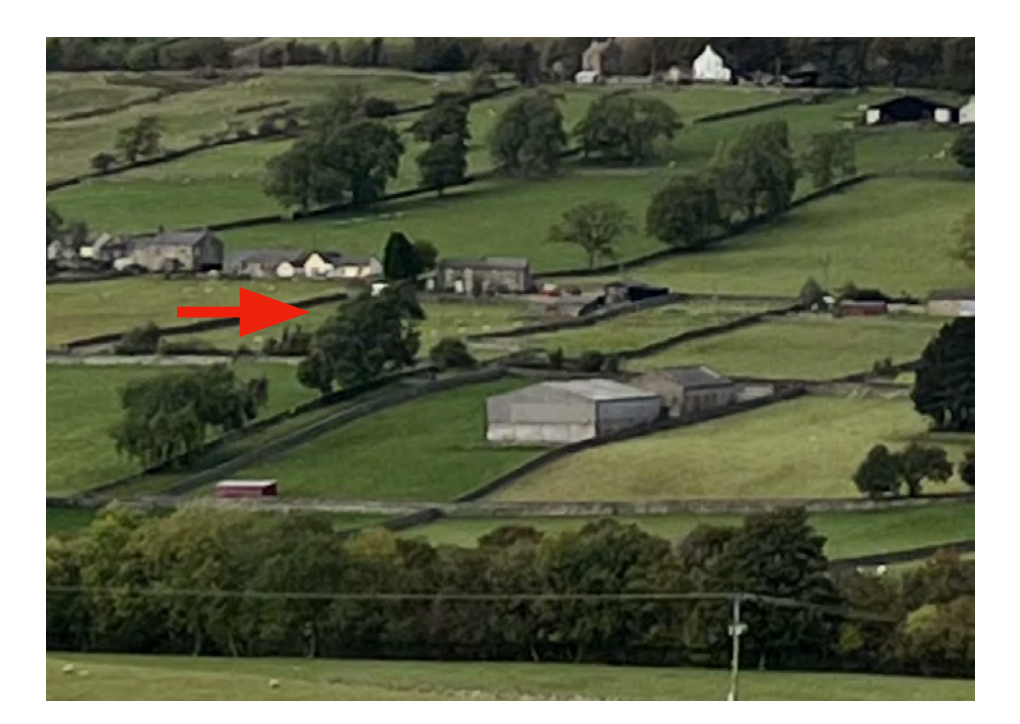
Pic 3 - Zoomed in