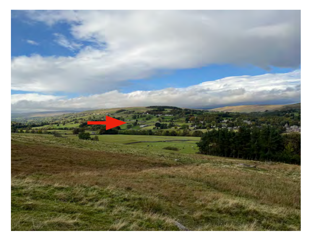
Pic 3 - up the fell on pennine way