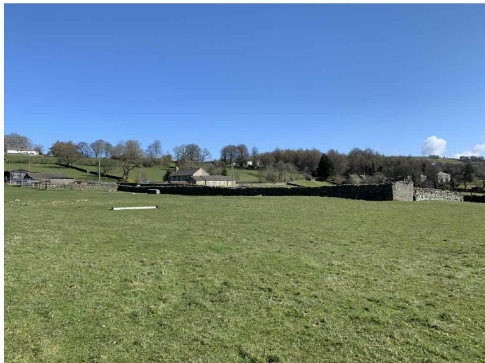
View 6 - View across proposed site