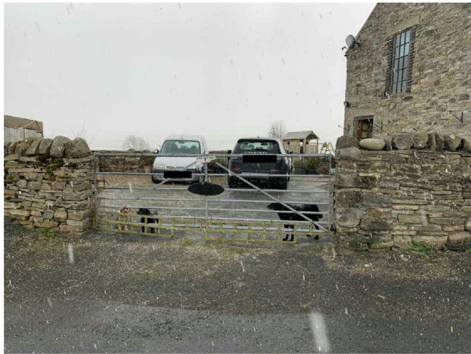
View 1 - Access from main road