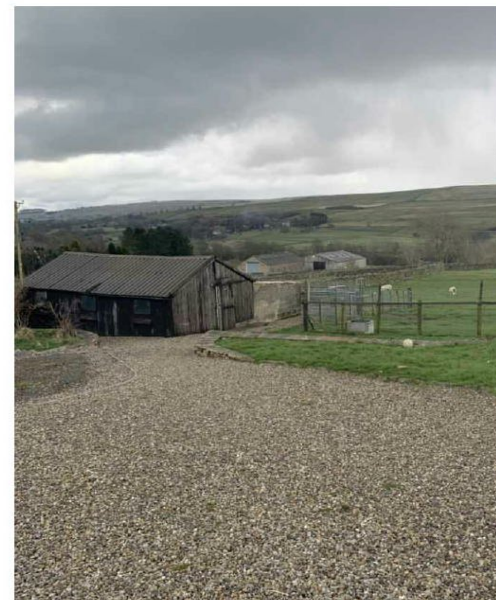
View 5 - Existing Entrance to the Site