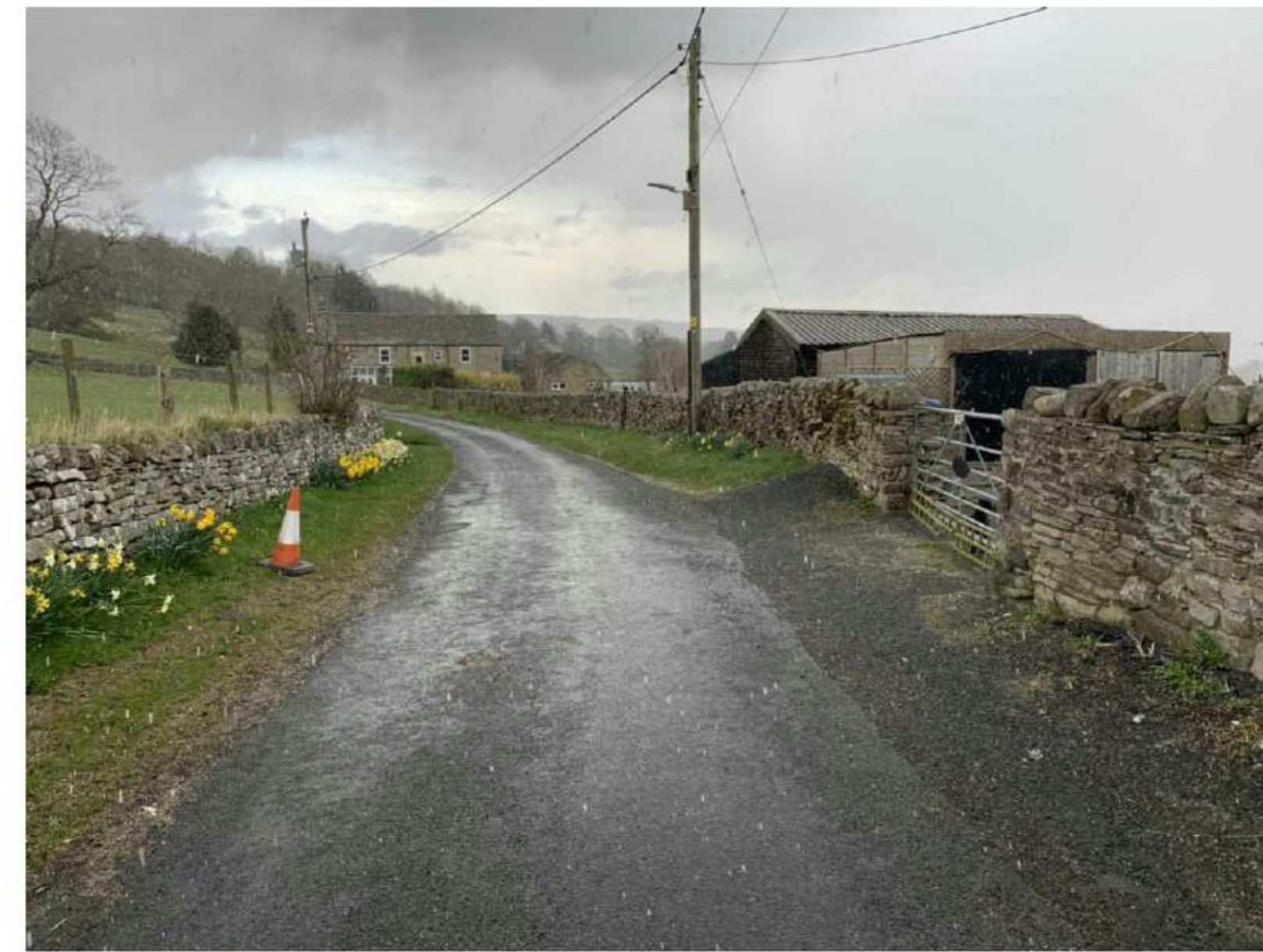
View 3 - Access road looking East