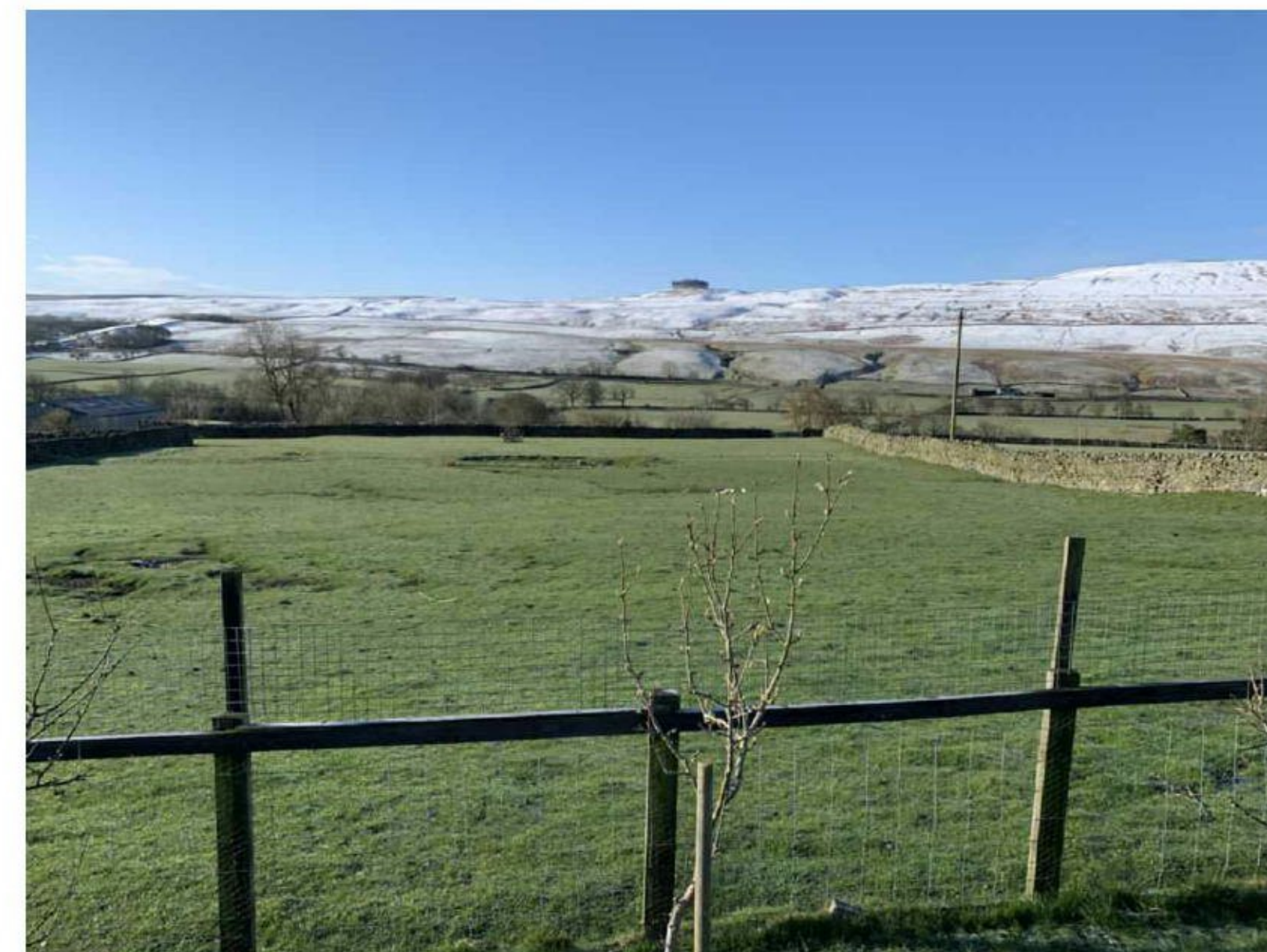
View 6 - View across proposed site