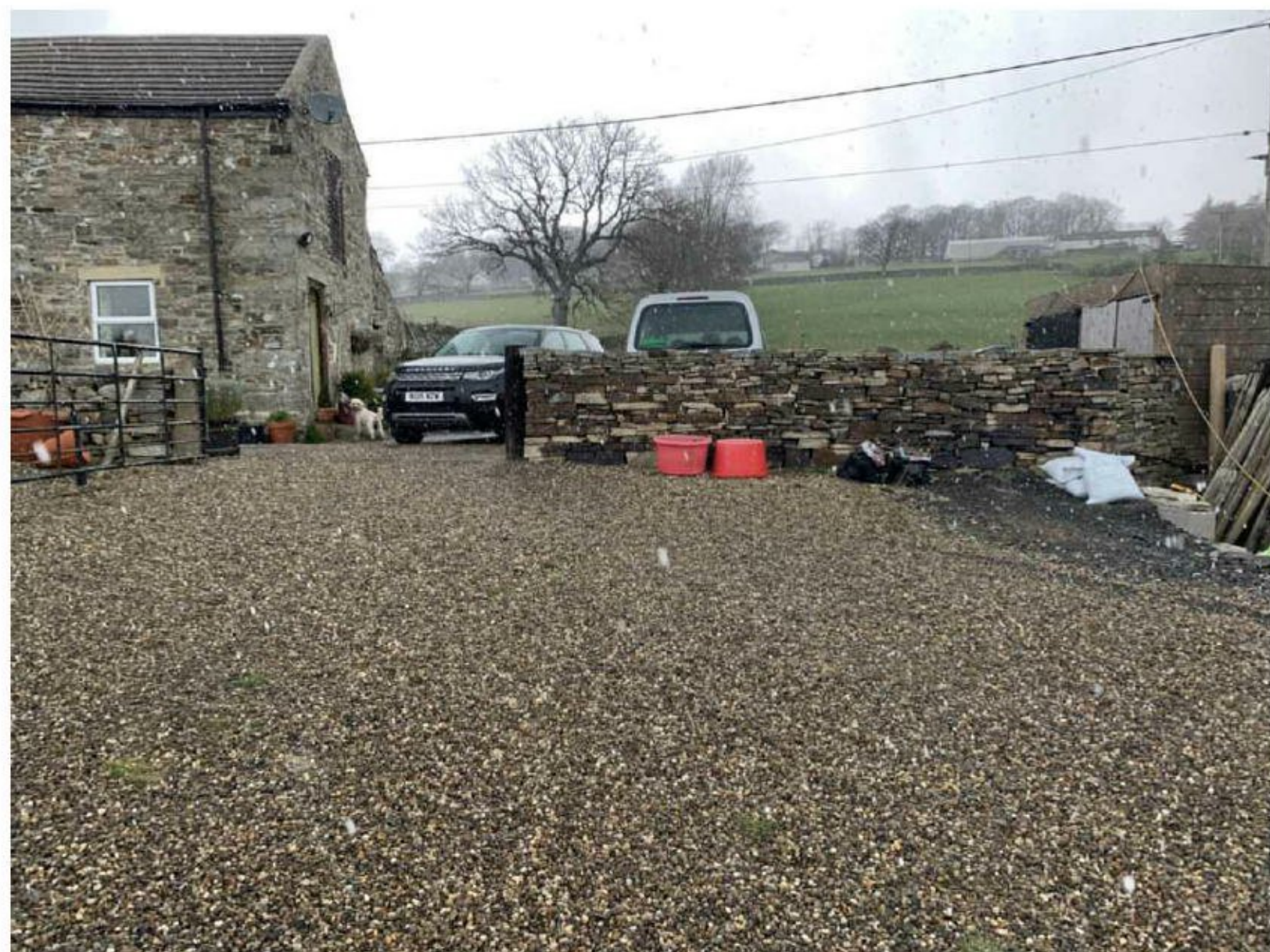
View 4 - Entrance gate from existing parking area