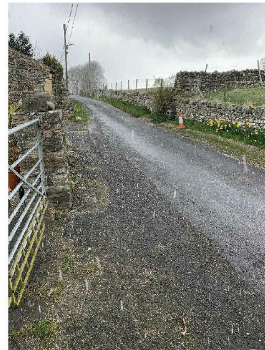
View 2 - Access road looking West