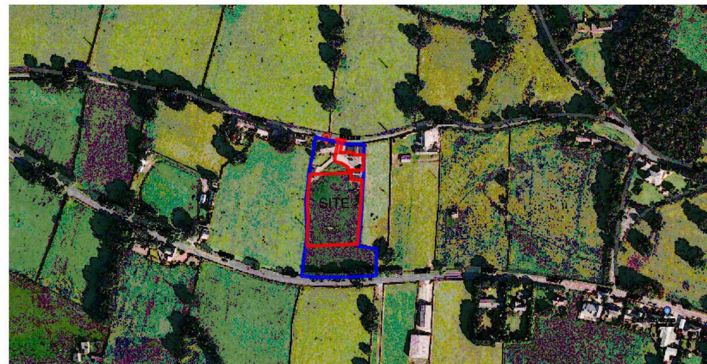
View 7 - Aerial View of the Site