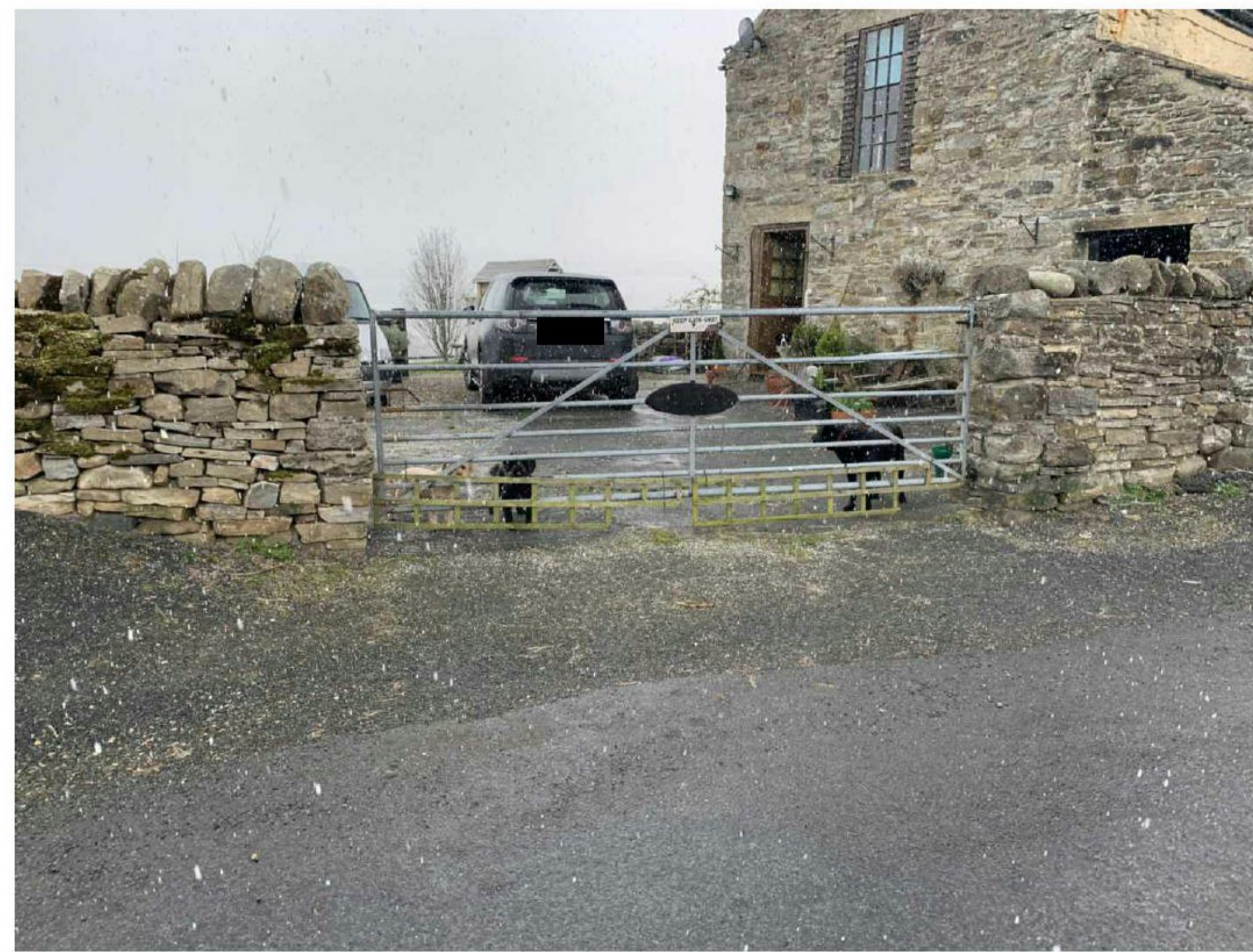
Existing entrance into site.