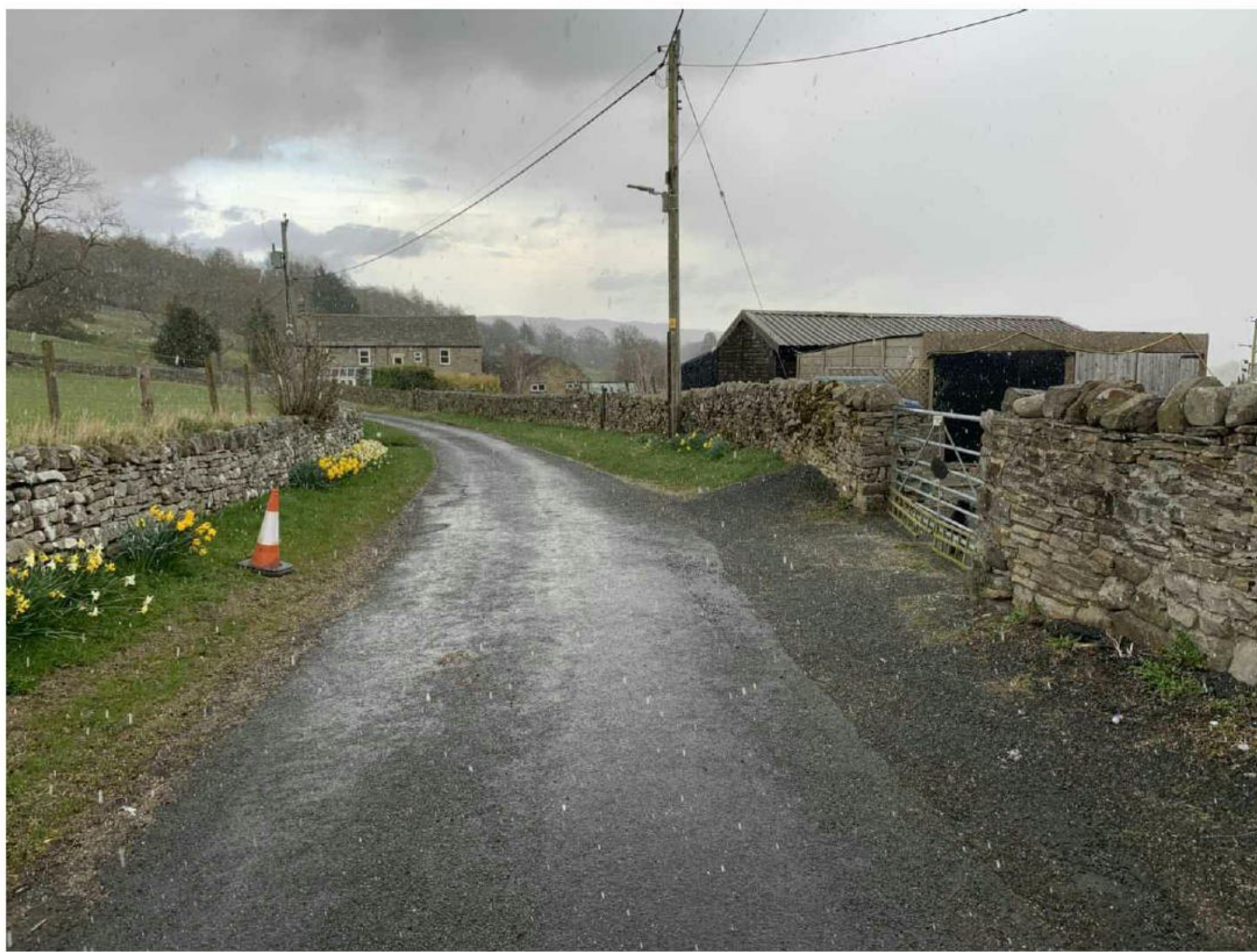
Existing entrance from main road.