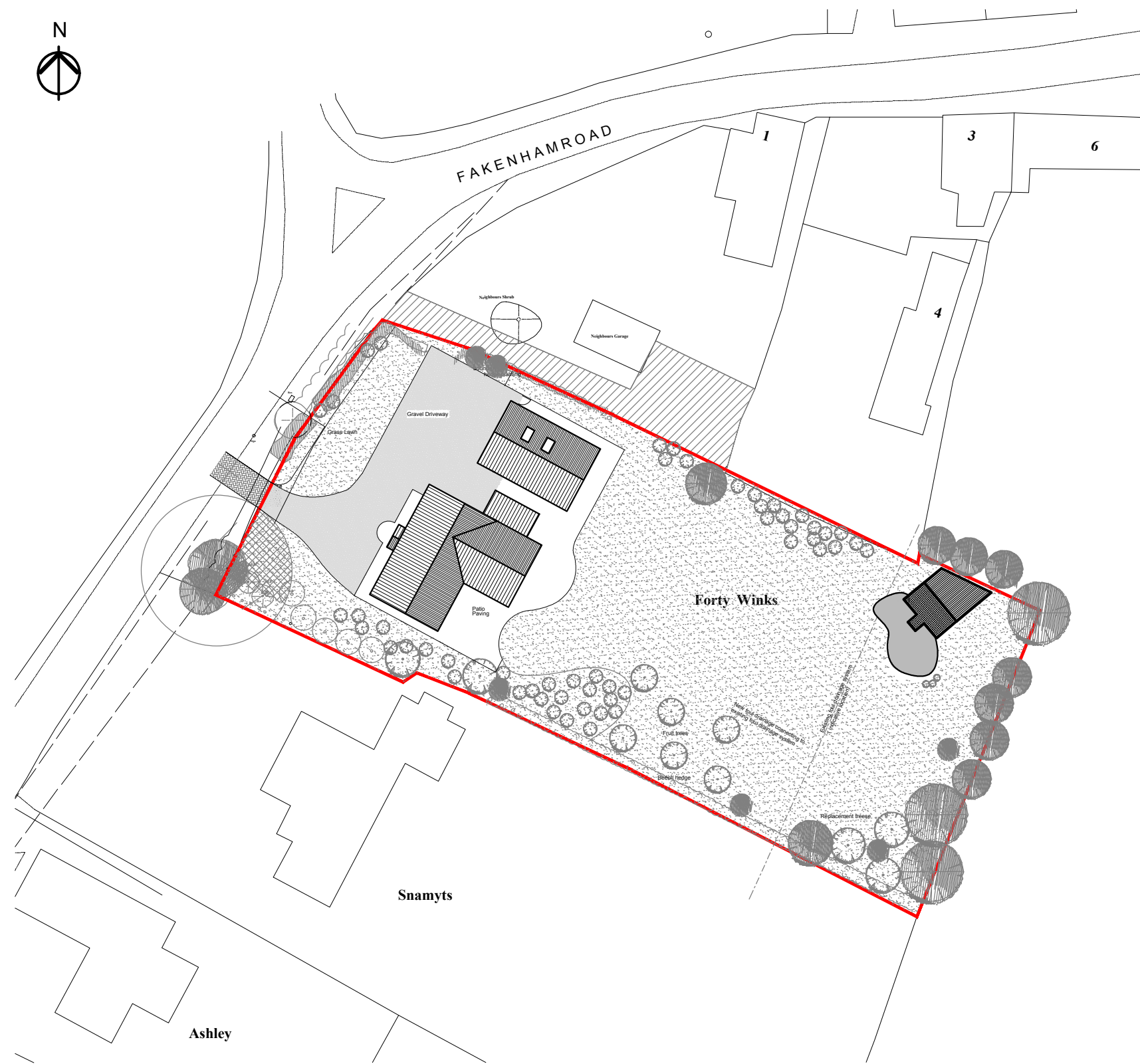
SITE PLAN 1:500 @ A3

PLEASE NOTE: Indicative landscaping- please refer to landscape design drawing for the landscaping design.