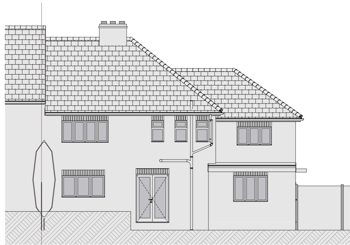
IE-02 Existing West Elev 1:100