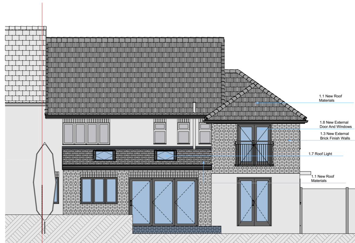
IE-02 Proposed West Elev 1:100