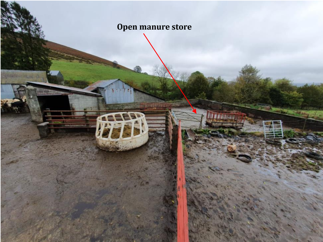
Open manure store