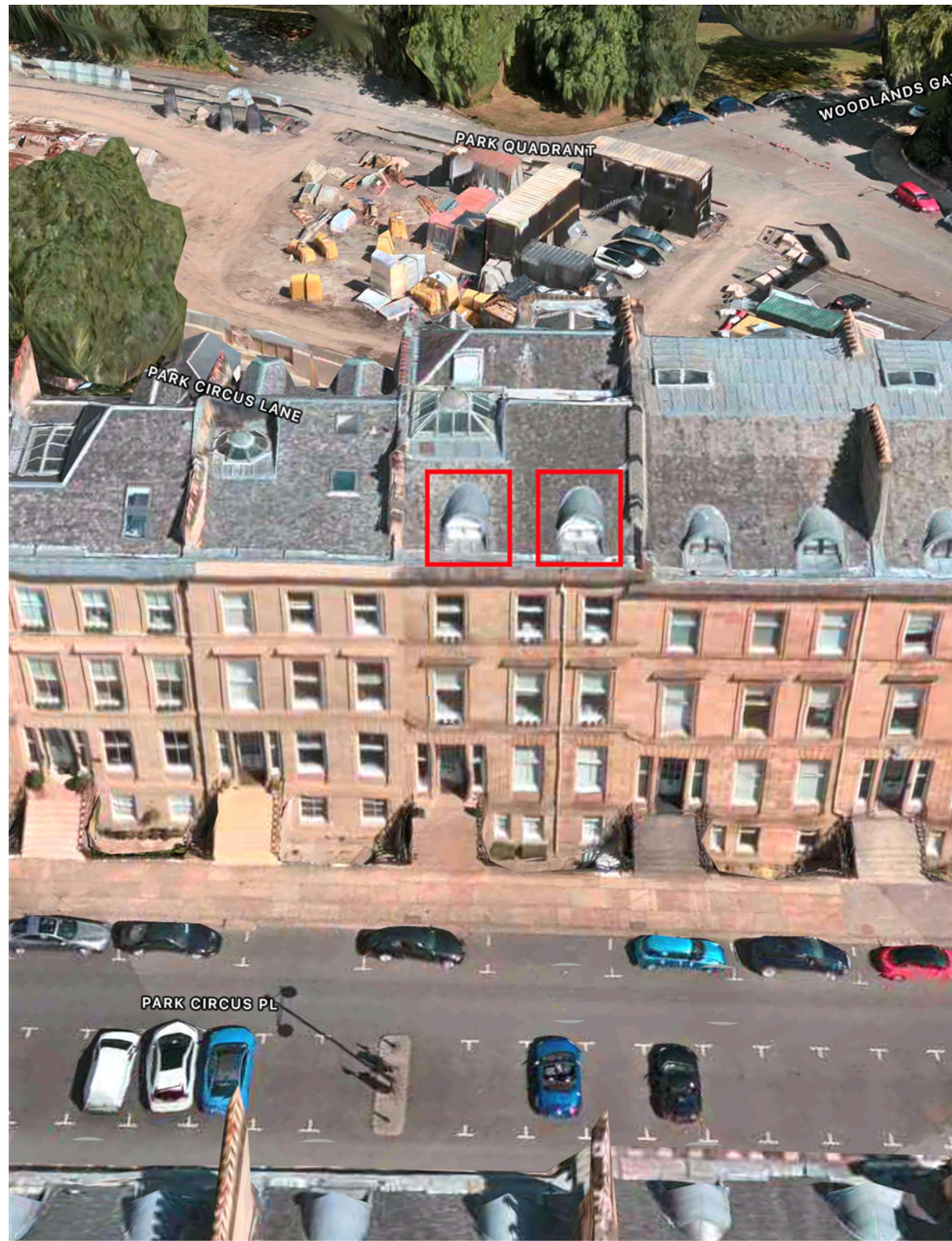
Photograph not possible from the street