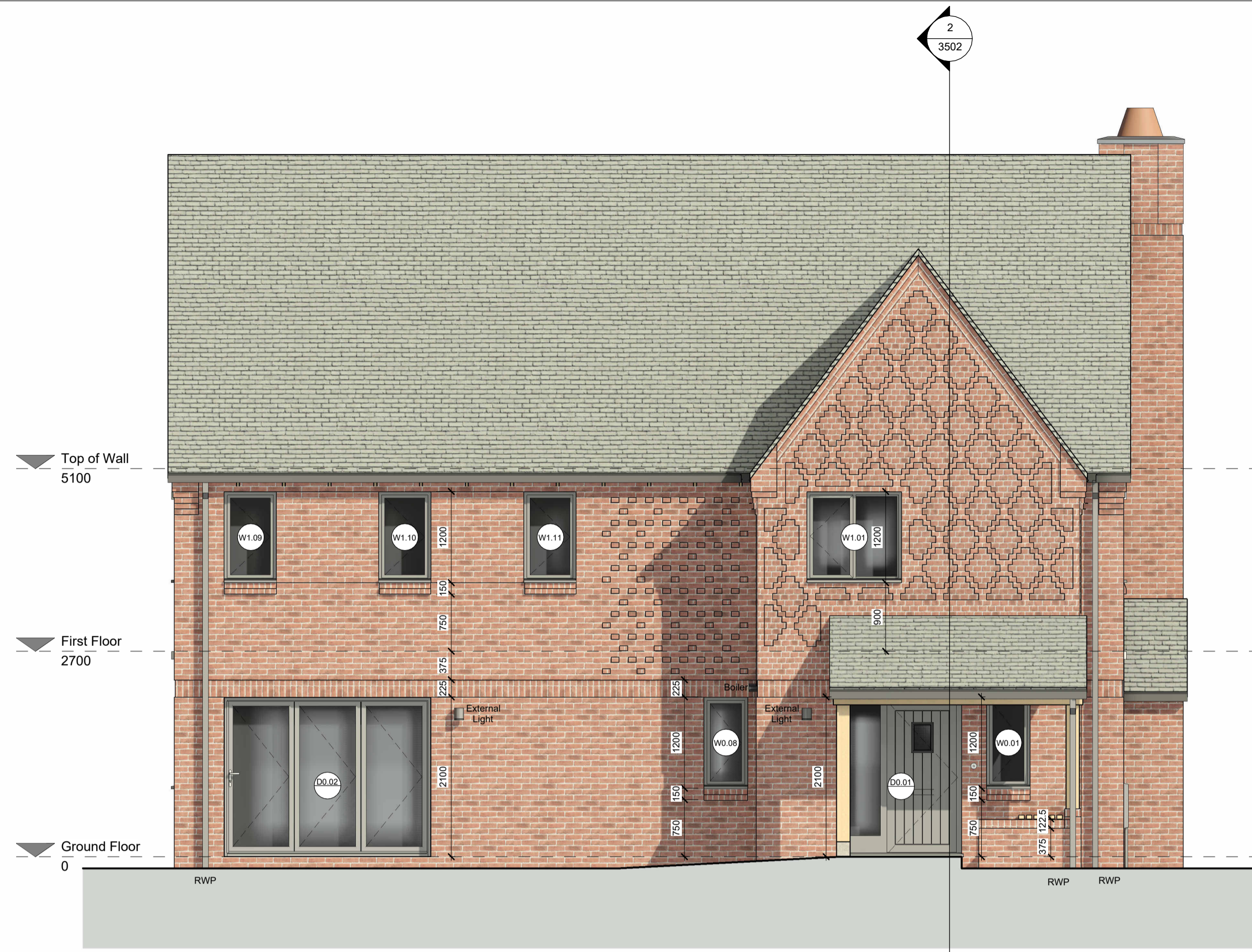
Front Elevation 1 : 50

○ BOWKER SADLER PARTNERSHIP LIMITED ■ THIS DRAWING IS THE SUBJECT OF COPYRIGHT WHICH VESTS IN BOWKER SADLER PARTNERSHIP LIMITED. IT IS AN INFRINGEMENT OF COPYRIGHT TO REPRODUCE THIS DRAWING BY WHATEVER MEANS, INCLUDING ELECTRONIC, WITHOUT THE EXPRESS WRITTEN CONSENT OF BOWKER SADLER PARTNERSHIP LIMITED WHICH RESERVES ALL ITS RIGHTS. BOWKER SADLER PARTNERSHIP LIMITED ASSERTS ITS RIGHTS TO BE IDENTIFIED AS THE AUTHOR OF THIS DESIGN. ■ DRAWING NOT TO BE SCALED. ■ REPORT ERRORS & OMISSIONS TO ARCHITECT. ■ CHECK ALL DIMENSIONS ON SITE. ■ DRAWING TO BE READ IN CONJUNCTION WITH THE HEALTH AND SAFETY PLAN AND ALL RELEVANT RISK ASSESSMENTS.