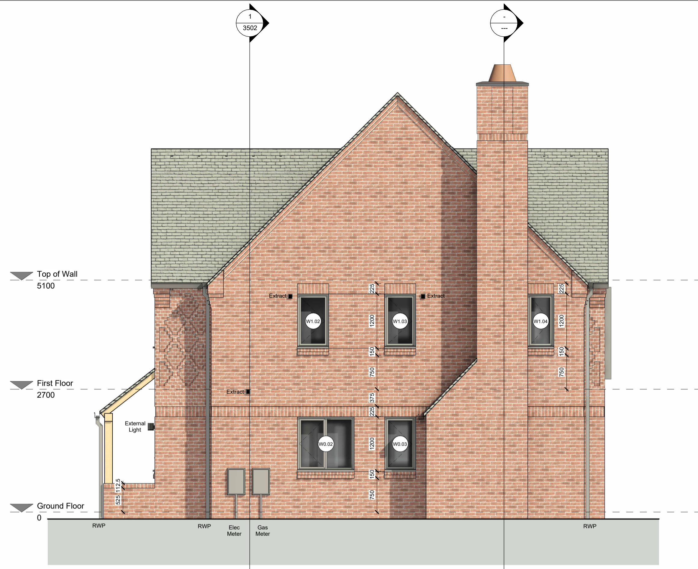
Right Elevation 1 : 50