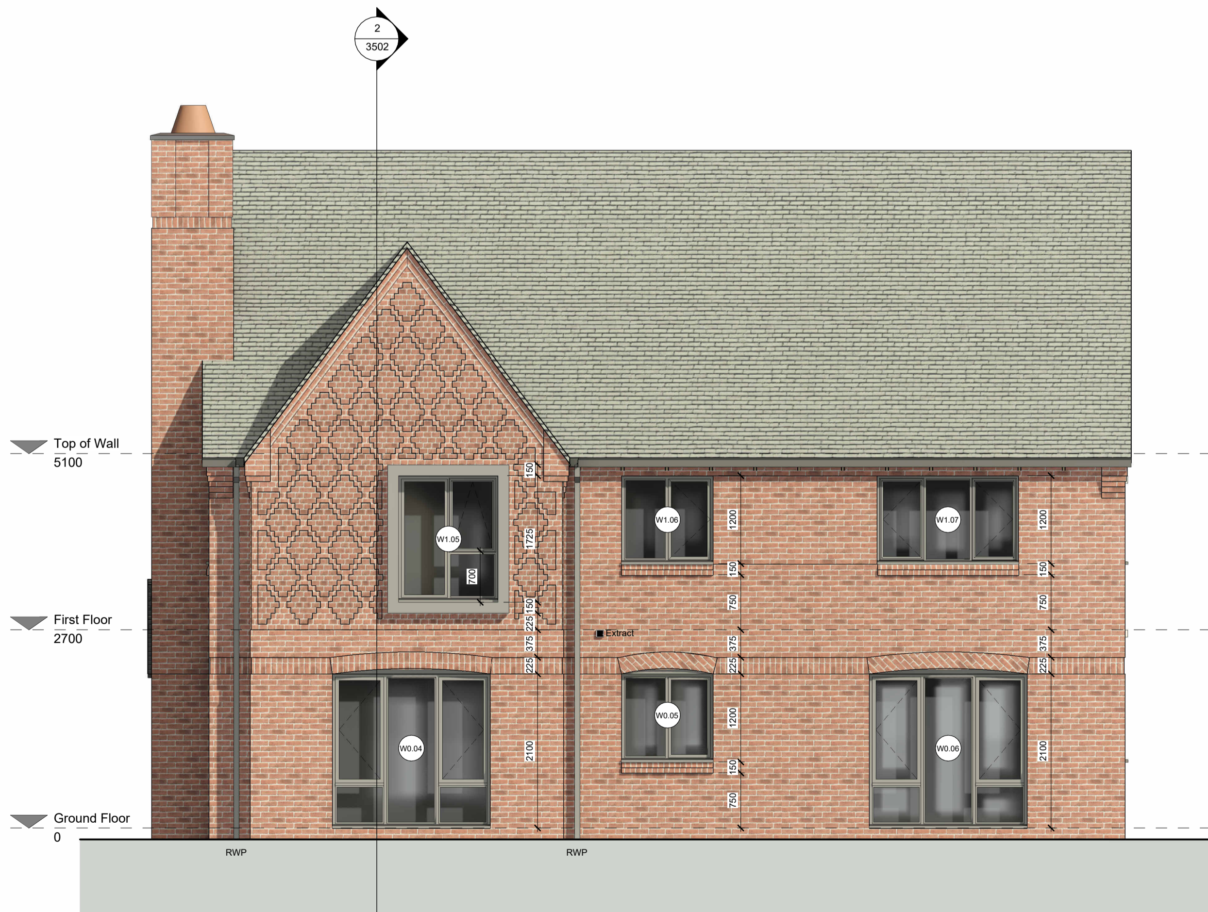
Rear Elevation 1 : 50