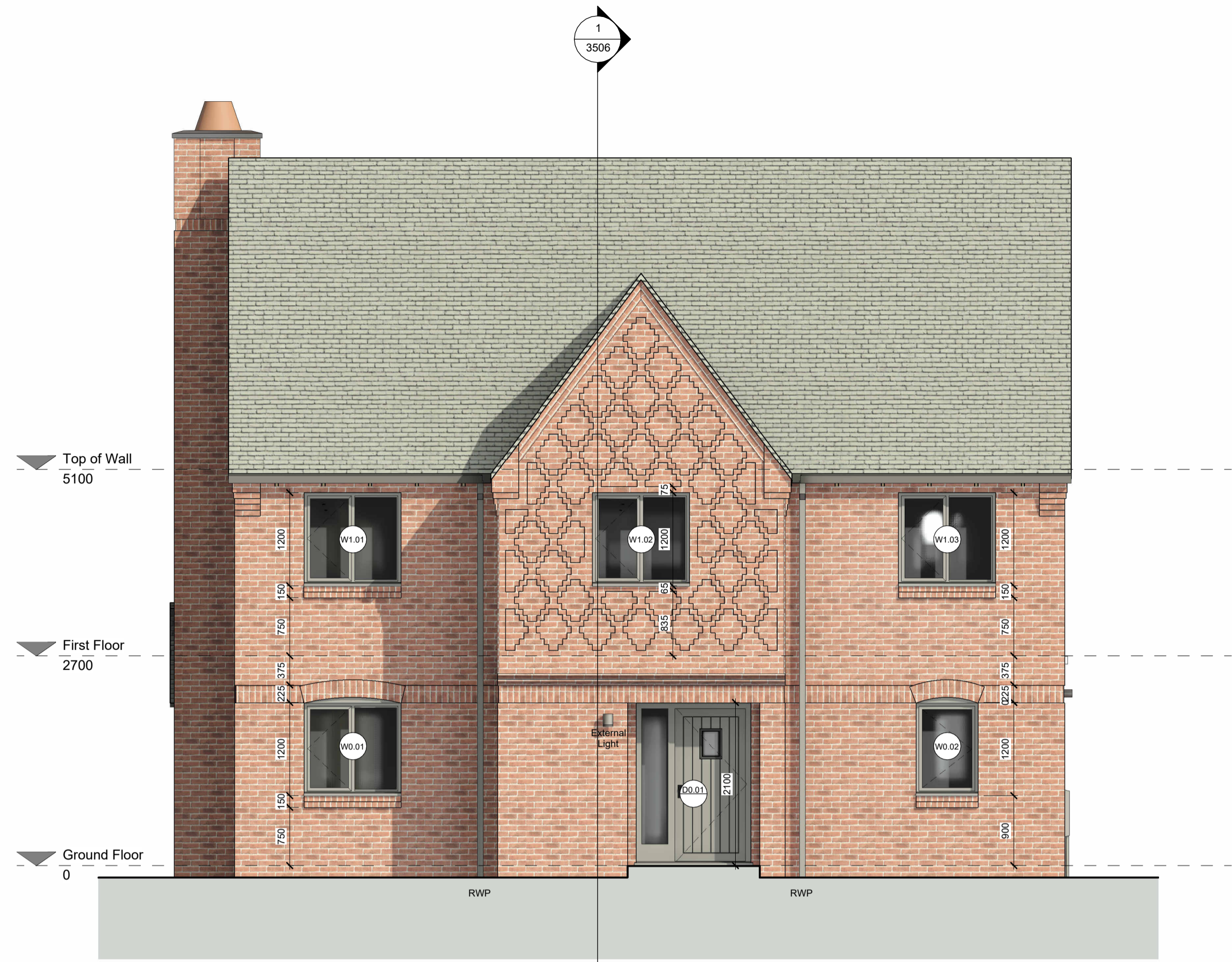
Front Elevation 1 : 50

○ BOWKER SADLER PARTNERSHIP LIMITED ■ THIS DRAWING IS THE SUBJECT OF COPYRIGHT WHICH VESTS IN BOWKER SADLER PARTNERSHIP LIMITED. IT IS AN INFRINGEMENT OF COPYRIGHT TO REPRODUCE THIS DRAWING BY WHATEVER MEANS, INCLUDING ELECTRONIC, WITHOUT THE EXPRESS WRITTEN CONSENT OF BOWKER SADLER PARTNERSHIP LIMITED WHICH RESERVES ALL ITS RIGHTS. BOWKER SADLER PARTNERSHIP LIMITED ASSERTS ITS RIGHTS TO BE IDENTIFIED AS THE AUTHOR OF THIS DESIGN. ■ DRAWING NOT TO BE SCALED. ■ REPORT ERRORS & OMISSIONS TO ARCHITECT. ■ CHECK ALL DIMENSIONS ON SITE. ■ DRAWING TO BE READ IN CONJUNCTION WITH THE HEALTH AND SAFETY PLAN AND ALL RELEVANT RISK ASSESSMENTS