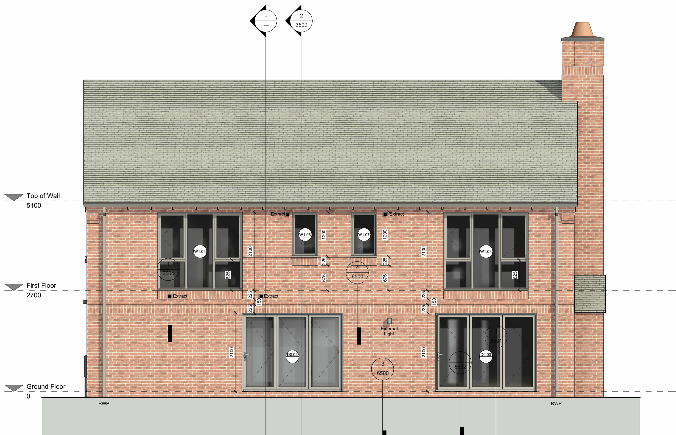
Rear Elevation 1 : 50