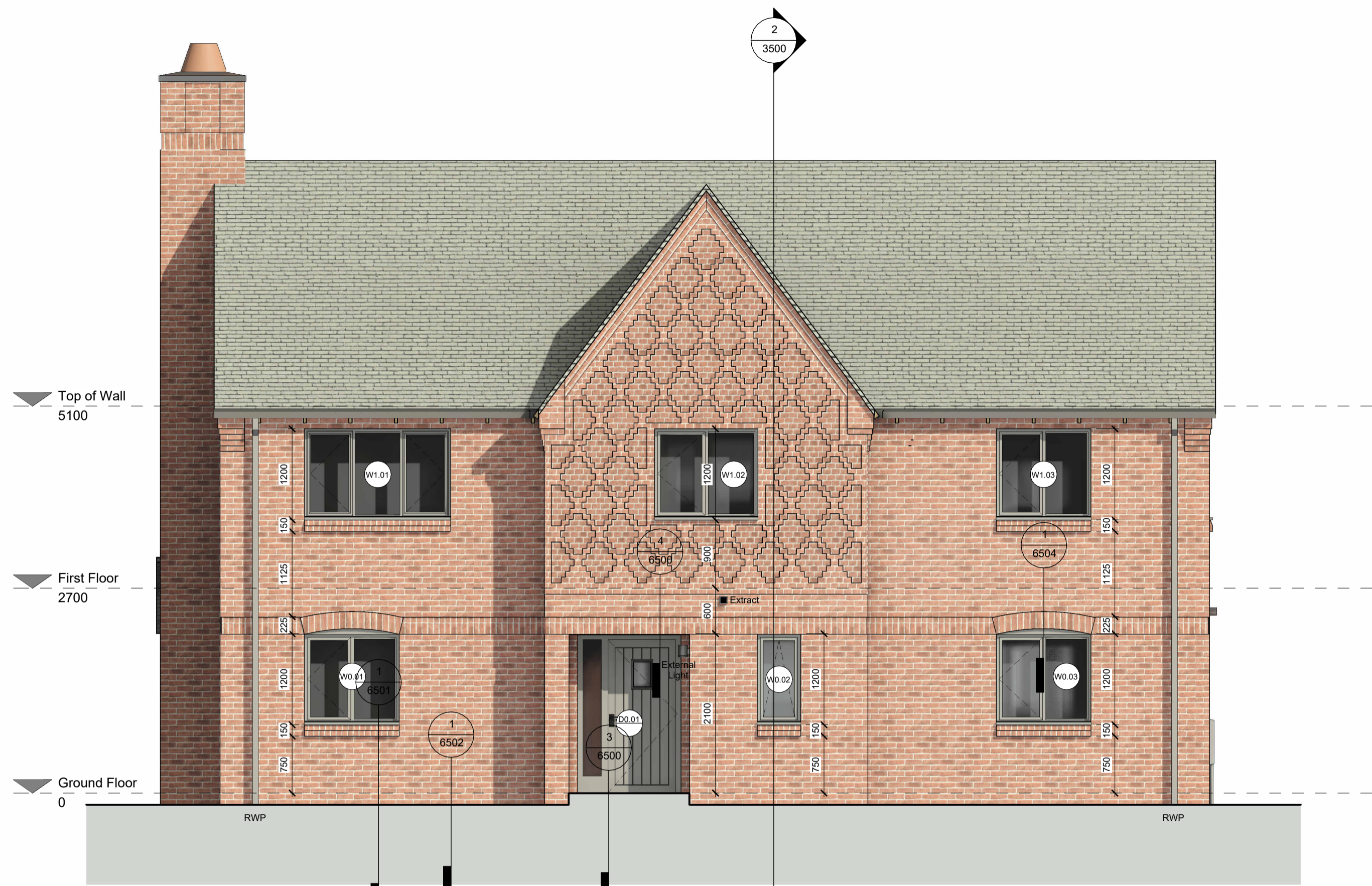
Front Elevation 1 : 50

○ BOWKER SADLER PARTNERSHIP LIMITED ■ THIS DRAWING IS THE SUBJECT OF COPYRIGHT WHICH VESTS IN BOWKER SADLER PARTNERSHIP LIMITED. IT IS AN INFRINGEMENT OF COPYRIGHT TO REPRODUCE THIS DRAWING BY WHATEVER MEANS, INCLUDING ELECTRONIC, WITHOUT THE EXPRESS WRITTEN CONSENT OF BOWKER SADLER PARTNERSHIP LIMITED WHICH RESERVES ALL ITS RIGHTS. BOWKER SADLER PARTNERSHIP LIMITED ASSERTS ITS RIGHTS TO BE IDENTIFIED AS THE AUTHOR OF THIS DESIGN. ■ DRAWING NOT TO BE SCALED. ■ REPORT ERRORS & OMISSIONS TO ARCHITECT. ■ CHECK ALL DIMENSIONS ON SITE. ■ DRAWING TO BE READ IN CONJUNCTION WITH THE HEALTH AND SAFETY PLAN AND ALL RELEVANT RISK ASSESSMENTS