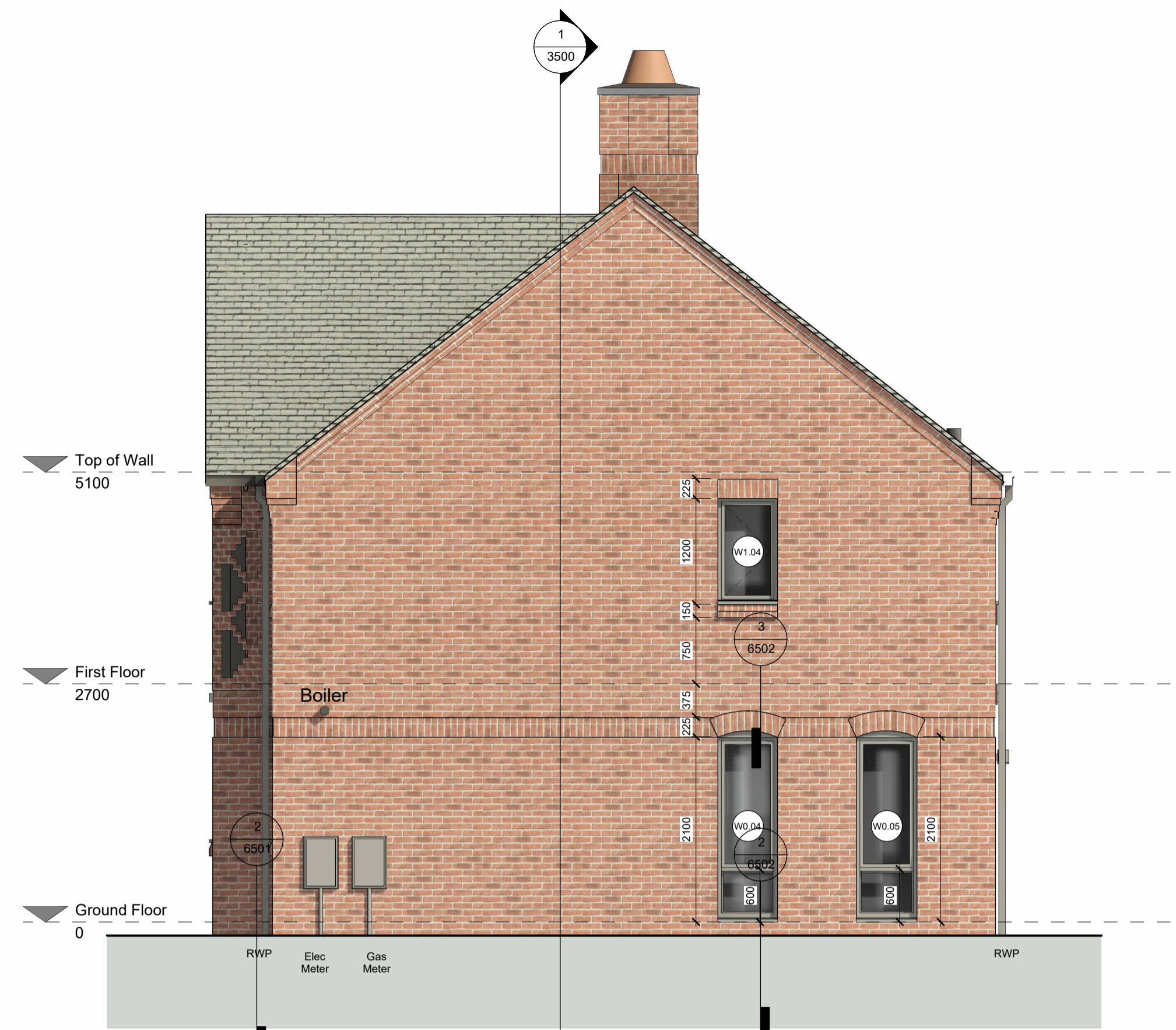
Right Elevation 1 : 50