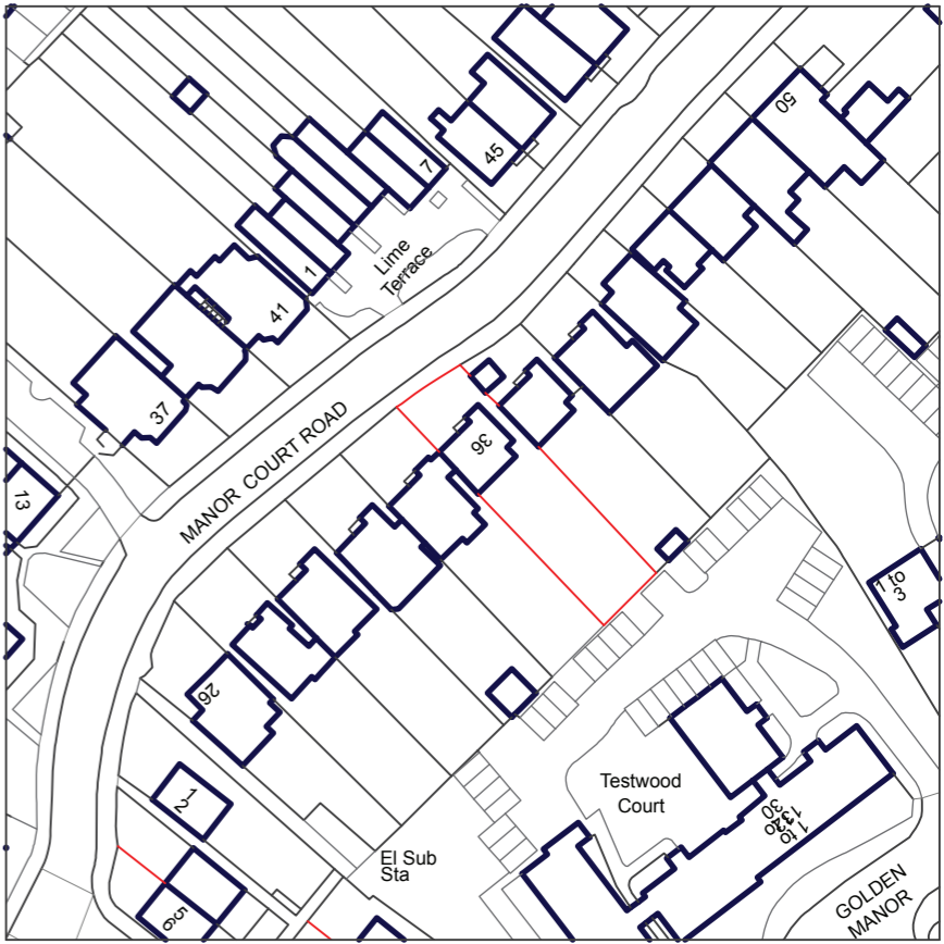
SITE PLAN - 00.01 36 MANOR COURT ROAD - HANWELL - Scale 1:1250