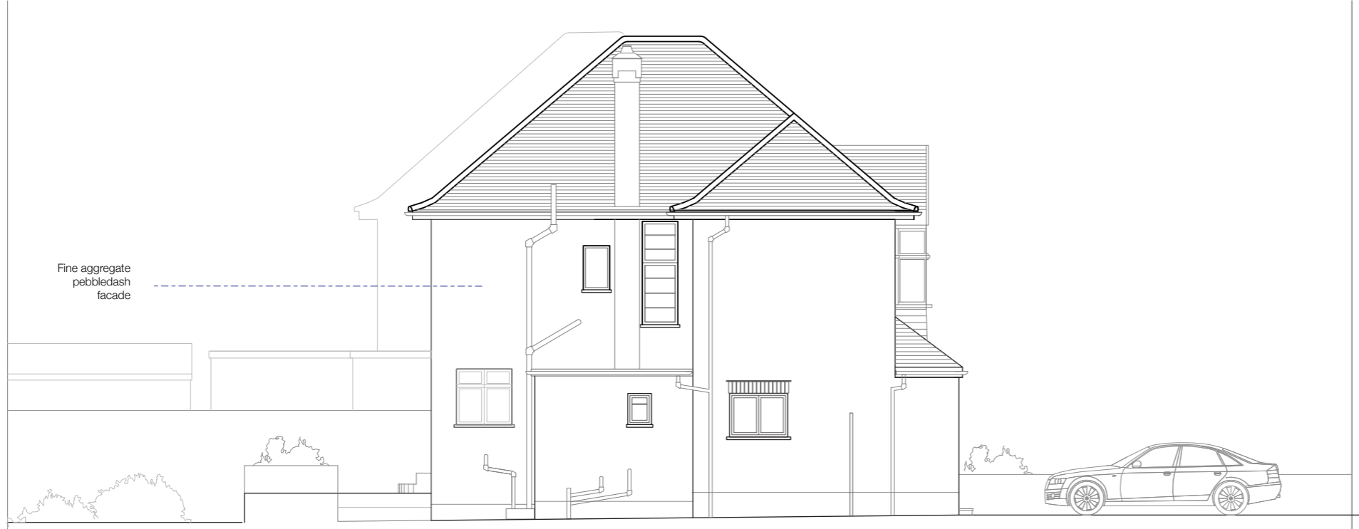
36 MANOR COURT ROAD EXISTING SIDE ELEVATION A - 00.01 Manor Court - Scale 1:100