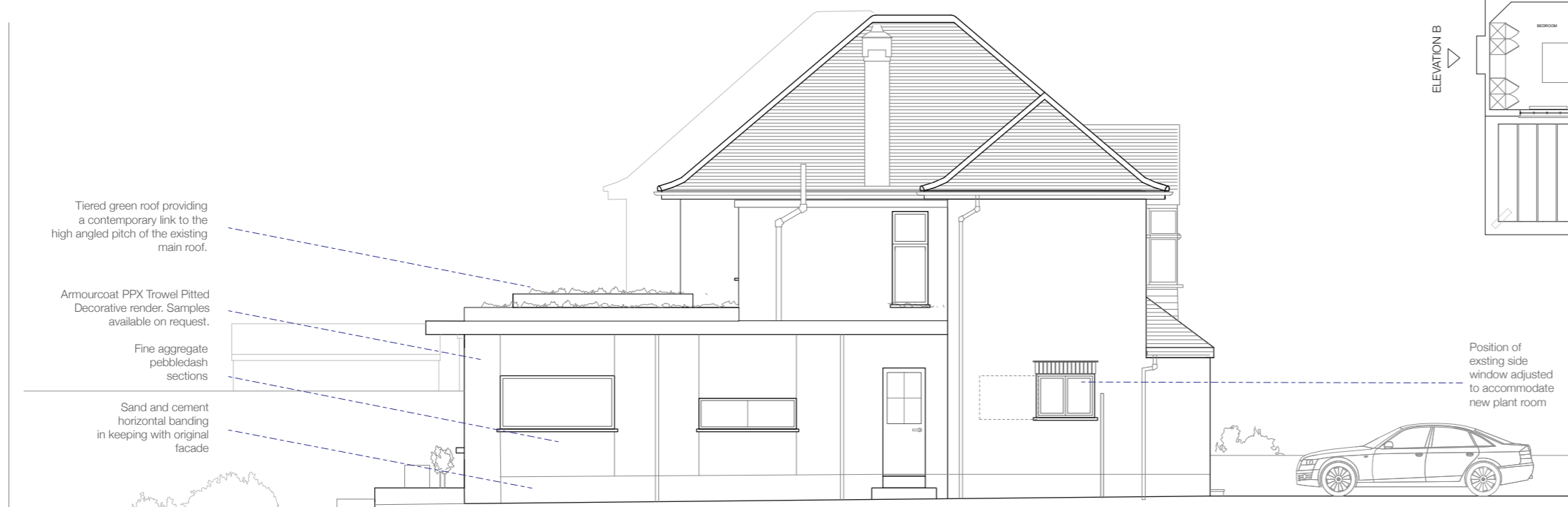
PROPOSED - SIDE ELEVATION A - 00.01 Manor Court - Scale 1:100