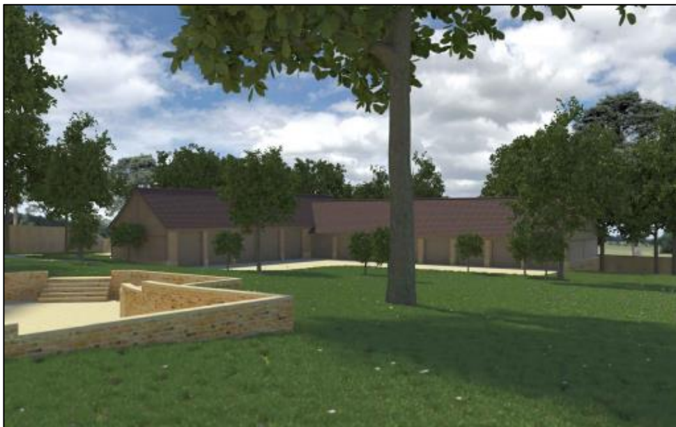
Figure 3.2 Proposed Garaging