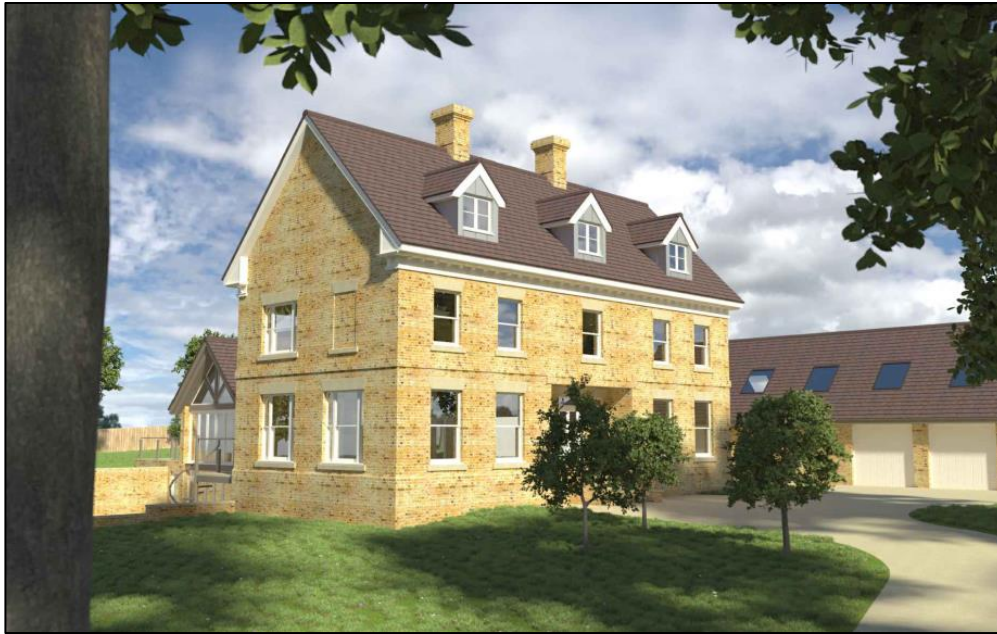
Figure 3.1 – Digital Render of the Front Aspect of the New House