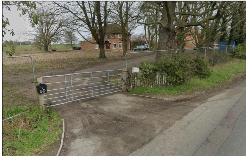
Figure 3.3 - Existing Access

form part of the entrance to this development. It is proposed that a second access is created to the east of the site leading onto Barton Hill.