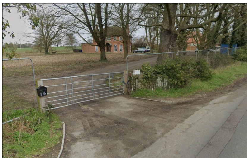
Figure 2.1 - Existing Access