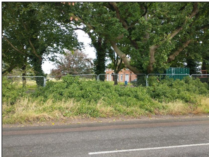
Figure 3.4 - Location of Secondary Access