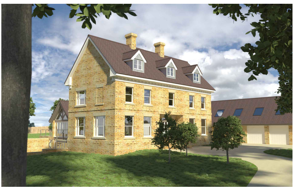
DWELLING front aspect