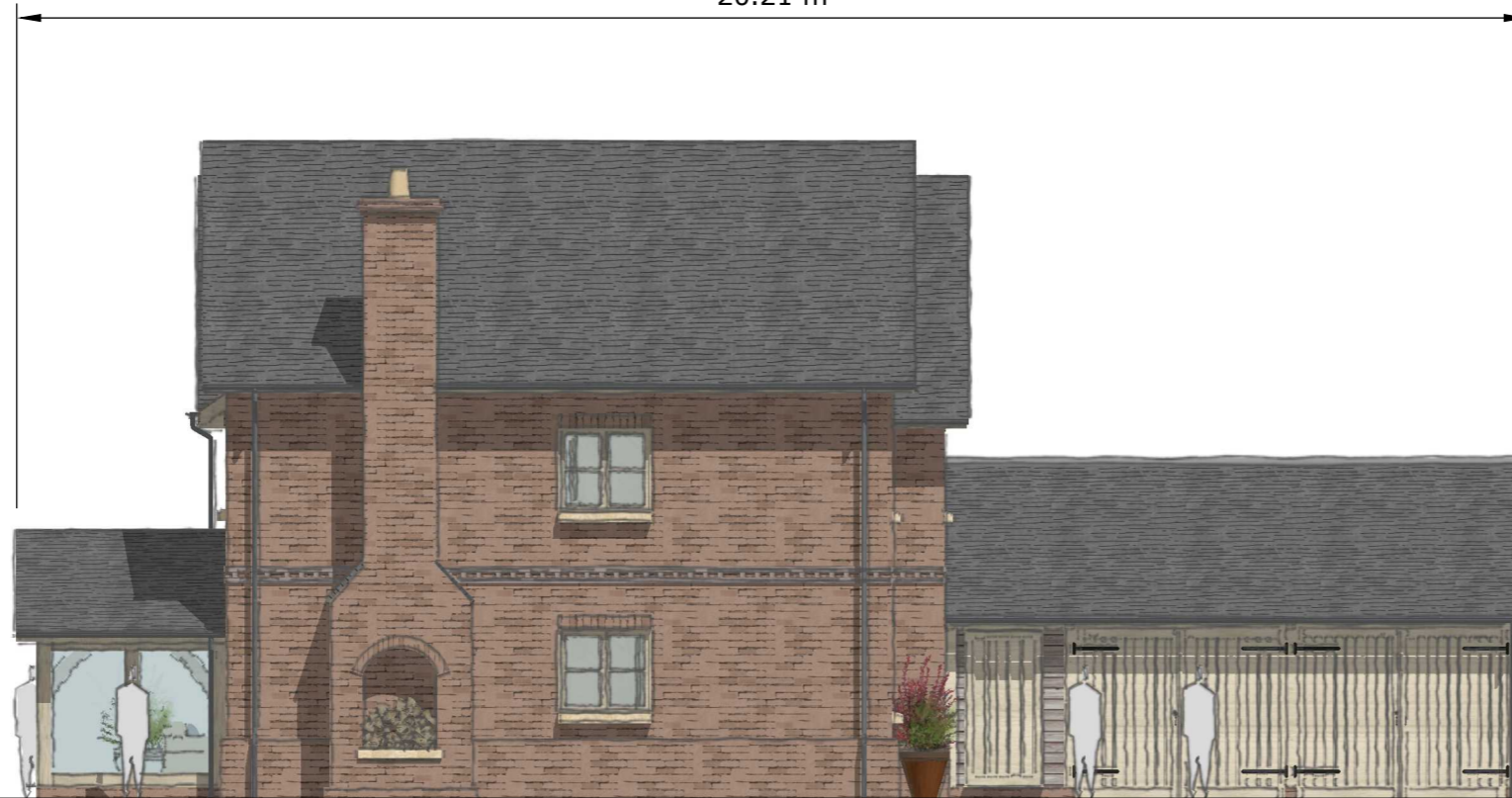
SIDE (EAST) ELEVATION Proposed Scale 1:100