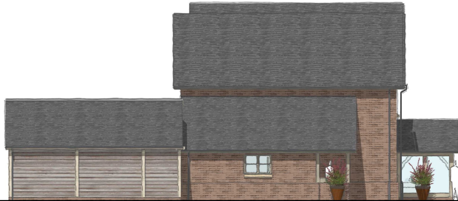
SIDE (WEST) ELEVATION Proposed Scale 1:100