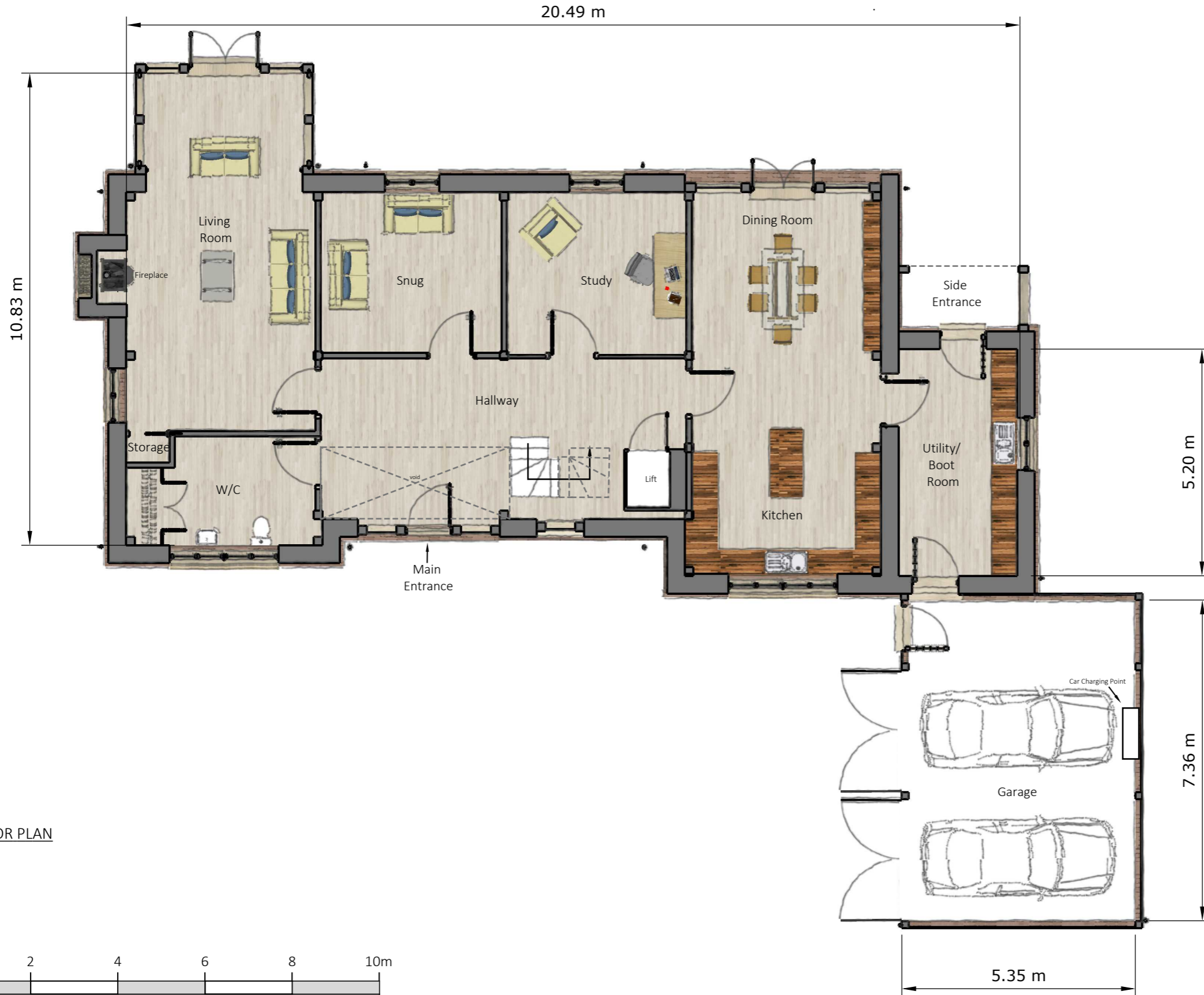
GROUND FLOOR PLAN Proposed Scale 1:100