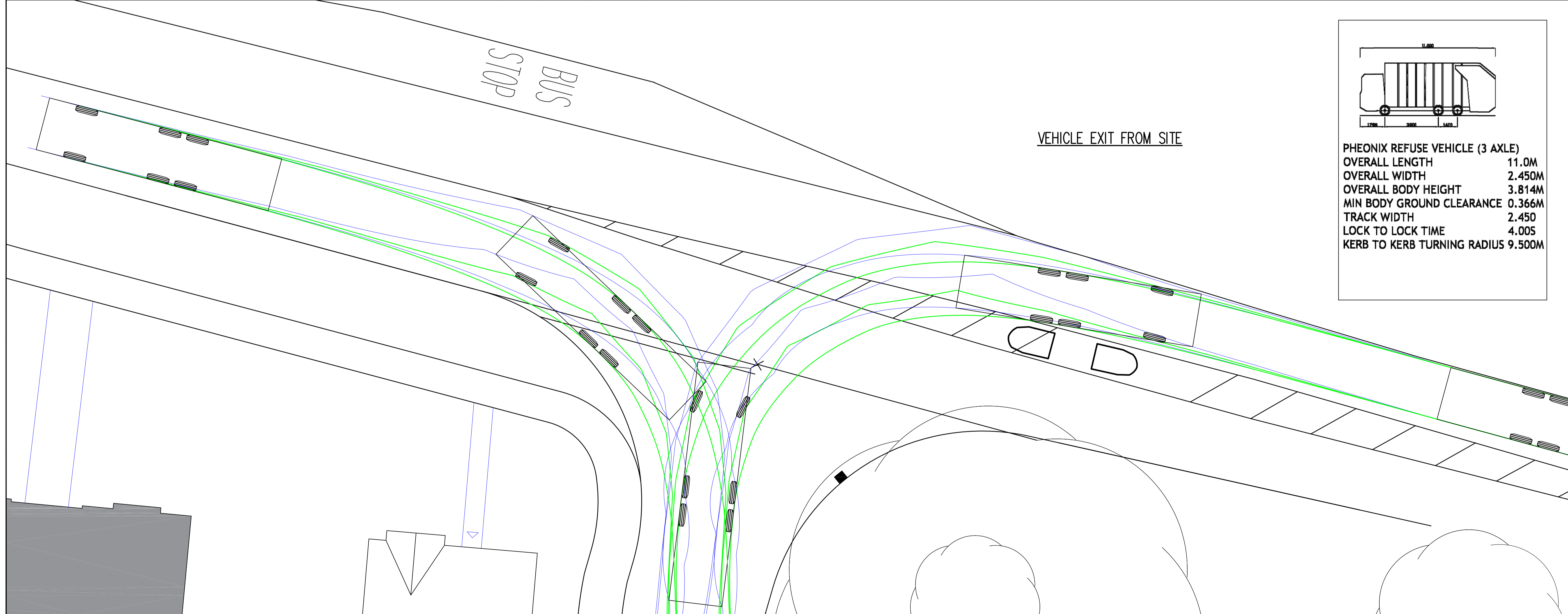
VEHICLE EXIT FROM SITE

PHEONIX REFUSE VEHICLE (3 AXLE) OVERALL LENGTH 11.0M OVERALL WIDTH 2.450M OVERALL BODY HEIGHT 3.814M MIN BODY GROUND CLEARANCE 0.366M TRACK WIDTH 2.450 LOCK TO LOCK TIME 4.00S KERB TO KERB TURNING RADIUS 9.500M