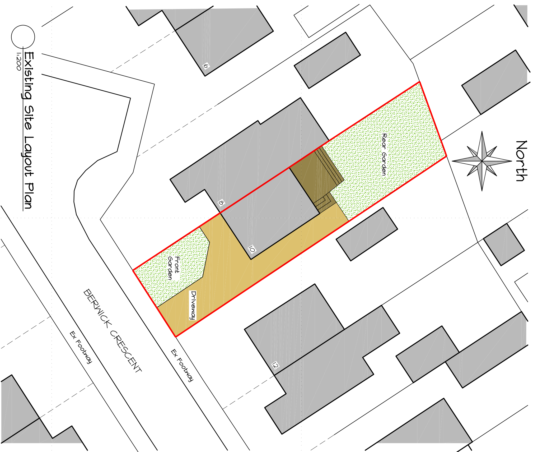
Existing Site Layout Plan 1:200