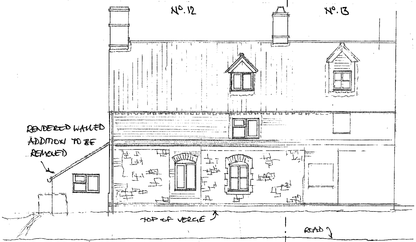
FRONT (NORTH) ELEVATION